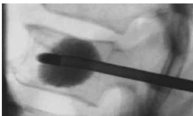
Fig 1. X-ray of lumbar vertebral in lateral projection taken after application of cement showing good position.

When applying LVC the needles were not removed before the end of polymerization to prevent spreading of cement on the paraspinal musculature if the needle is removed earlier, and when HVC was used, the needles were