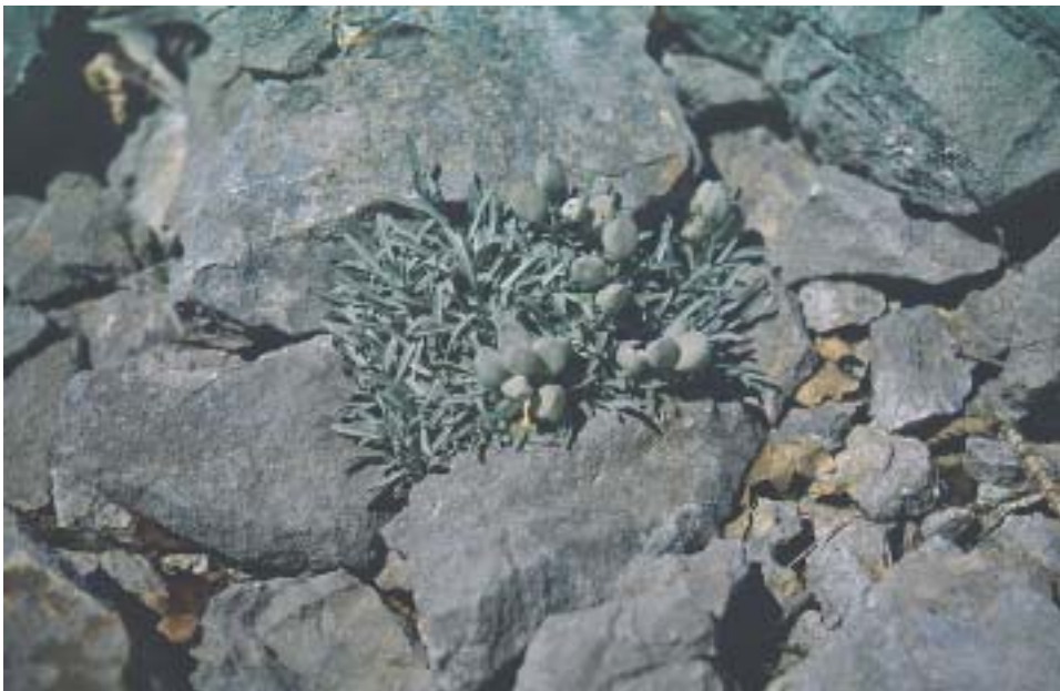
Fig. 2. Degenia velebitica (Degen) Hayek at flowering and at stage of fructification on new locality