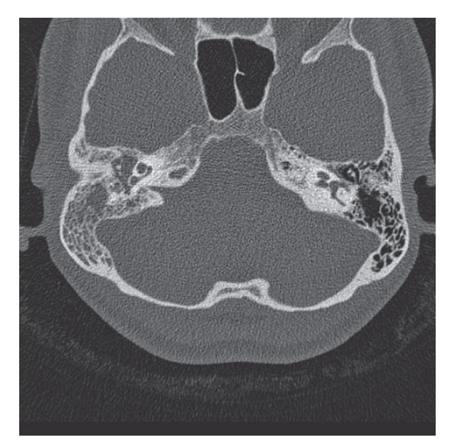
Figure 1 The initial axial CT scan through the right-side temporal bone shows total shadowing of the mastoid process and tympanic cavity

We do not have the results of the initial audiometry made at the Clinical Hospital in May 2009, but