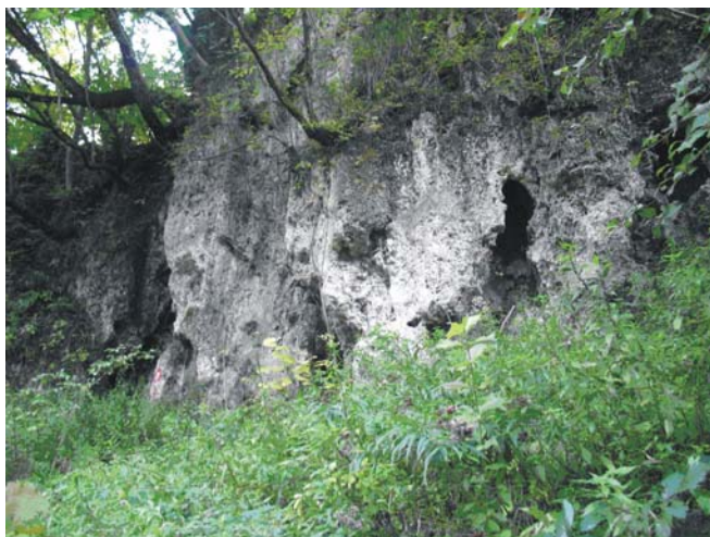
Fig. 2. The Vilinske jame cave

The Židovske kuće cave is a multi-level cave, 31 m long and 8 m deep with the entrance 7×5 m in diameter (Fig. 3). It is situated in the vicinity of Budinjak (N. BUZJAK, 2001), in a beech forest at 741 m a.s.l.