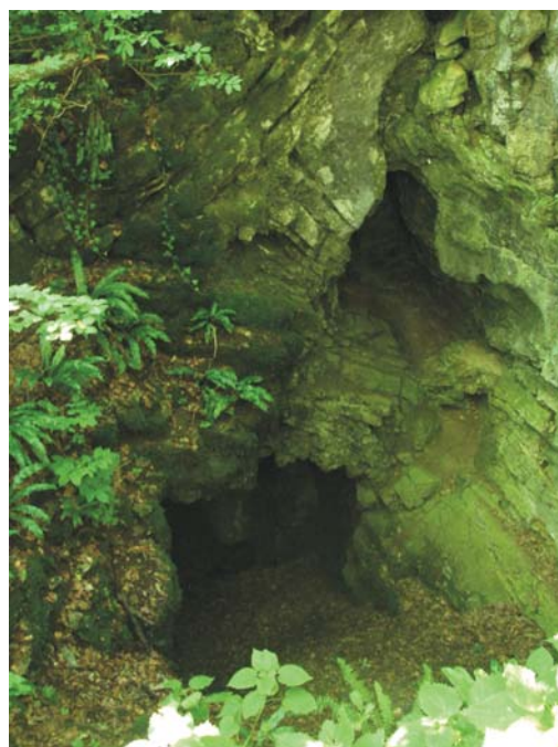
Fig. 3. The Židovske kuće cave

The Židovske kuće cave is a multi-level cave, 31 m long and 8 m deep with the entrance 7×5 m in diameter (Fig. 3). It is situated in the vicinity of Budinjak (N. BUZJAK, 2001), in a beech forest at 741 m a.s.l.