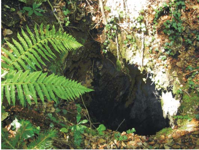
Fig. 4. The Jama na dugom bregu obr Gabrovice pit

The Tomaševićka pit and the Židovske kuće cave were formed in Upper Cretaceous ( K_2 ) carbonate rocks of a very heterogeneous lithologic structure: calcareous breccia, zoogenic breccia with limestone interbeds, conglomerates, limestone with interbeds and nodules of chert. The site survey of both speleological features determined the geological base of layered limestone with chert interbeds.