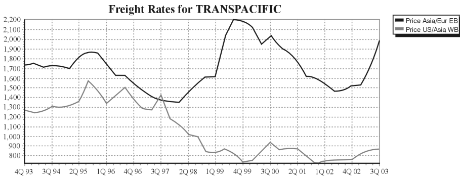
Fig. 2 – Transpacific freight rates