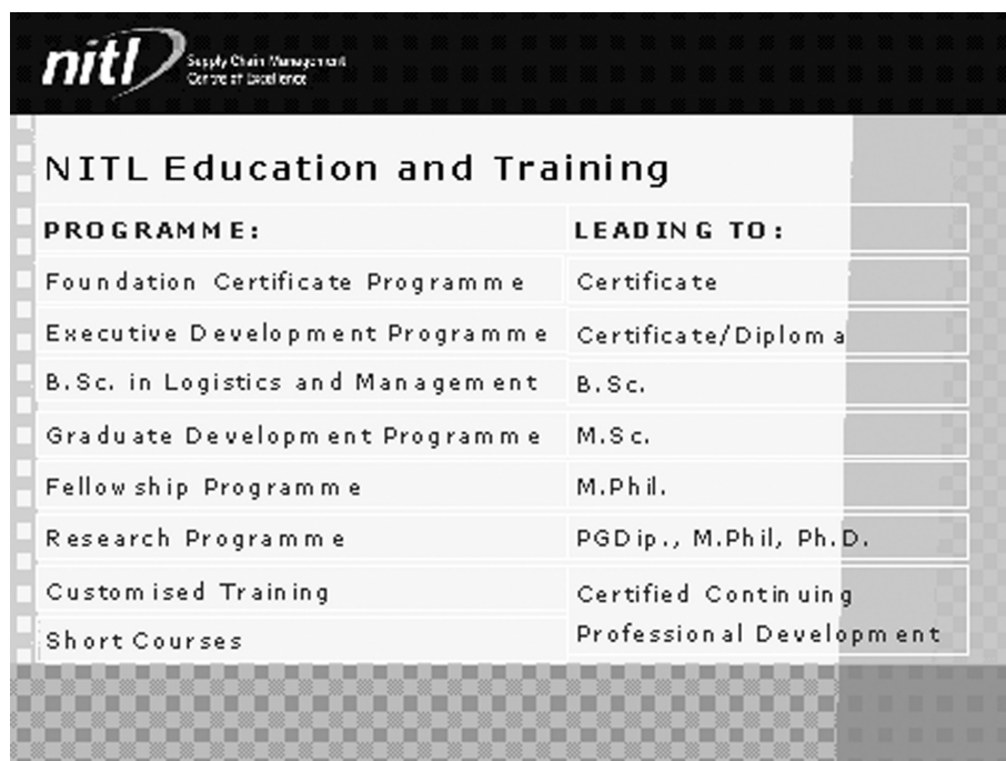
Table 2 - NITL's Supply Chain Learning Programmes

The range of programmes reflects the requirements of different levels of staff in organisations in all parts of the supply chain (e.g. manufacturing, logistics service provision and retail). The most recent addition to the portfolio is the Foundation Certificate Programme (FCP) which came into existence to satisfy a particular requirement and which has been adopted by several port community member companies in Ireland.