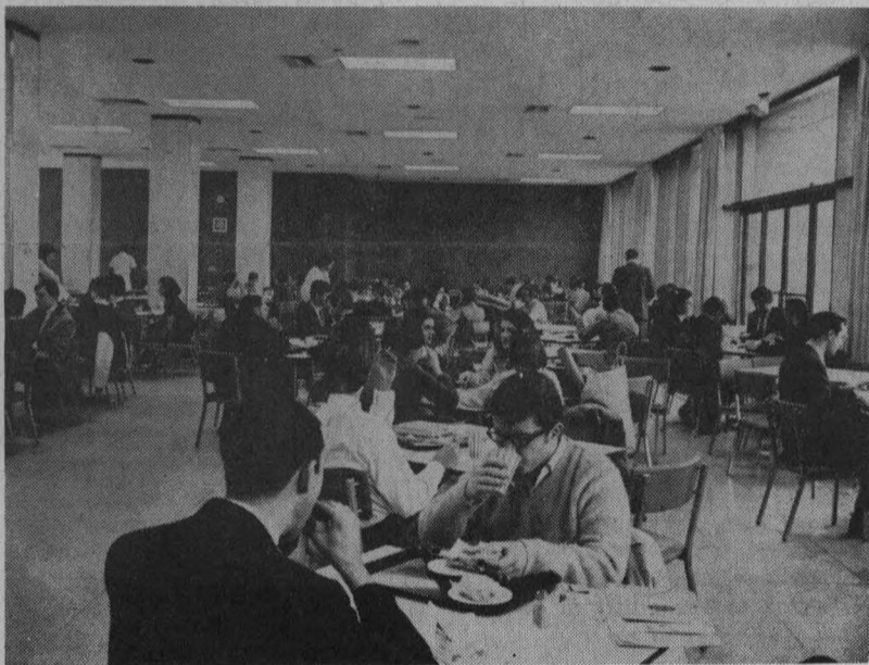
With less than half the expected student body in the new building, the cafeteria is already feeling the strain of crowds and longlines.

Standing 156 feet high, the 14 story structure (including two penthouse levels), is designed to eventually accommodate 7,000 students. The edifice, rapidly becoming known as the Ivory Tower, features such essentials as plush carpeting, lavish lounges, and a faculty-alumni complex which resembles the Playboy Penthouse. All this and more is expected when the entire Leon Lowenstein Center is completed at a cost of $17.5 million.