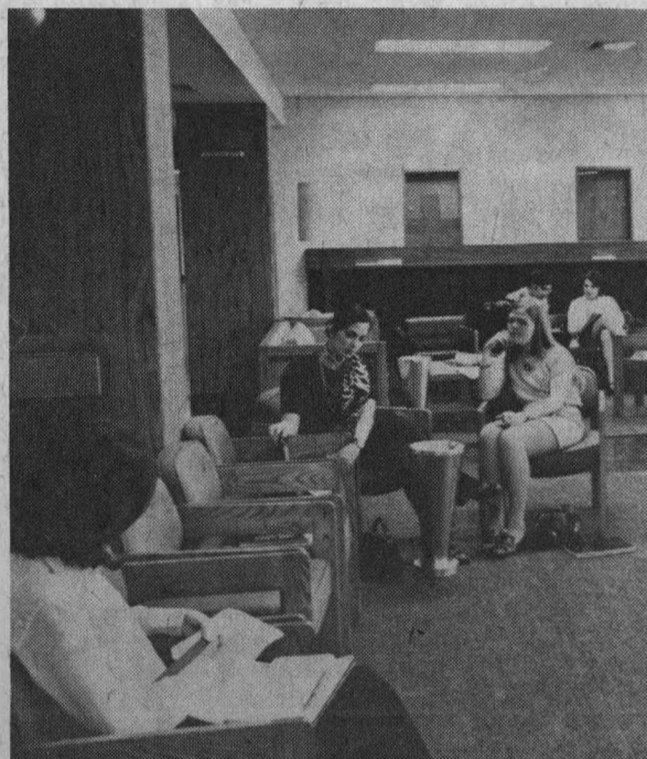
The second floor student lounge features modern furniture and attractive carpets. The two views (above and to the right) shown were taken at the same time. Co-education has arrived at Lincoln Center, but fraternization has not.