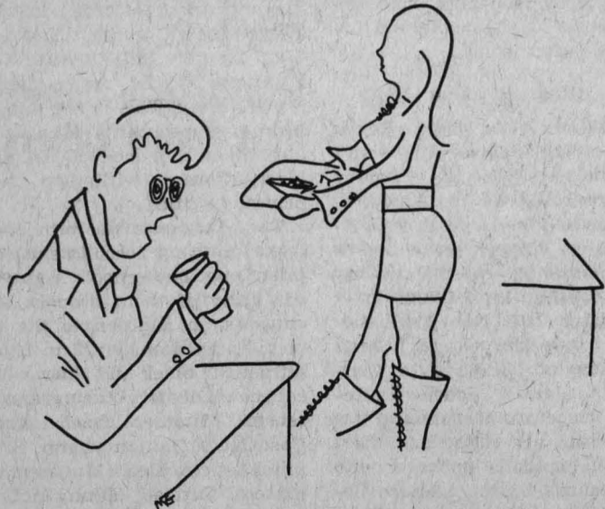
The new cafeteria? Well, the food isn't great but the VIEW ...