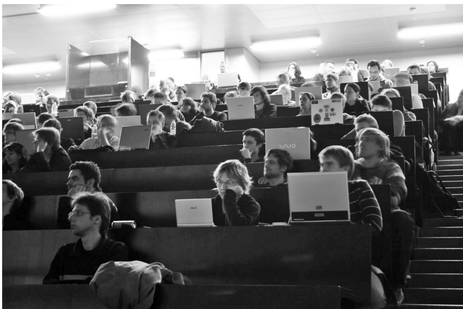
Figure 3. Picture of lecture room.

Due to the fact that different communication channels had been offered, students were very busy during the whole lecture. Based on video observation during the whole lecture and the