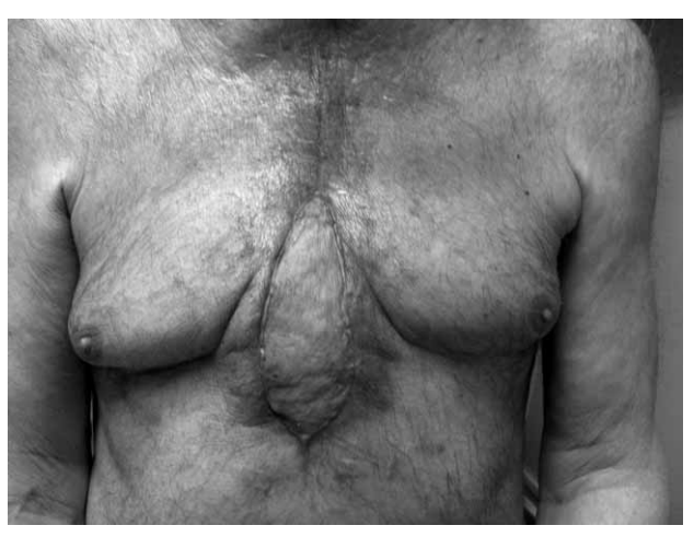
Fig. 4. Patient 1 after six month follow up.