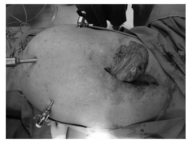
Fig. 2. Reposition of omental flap.