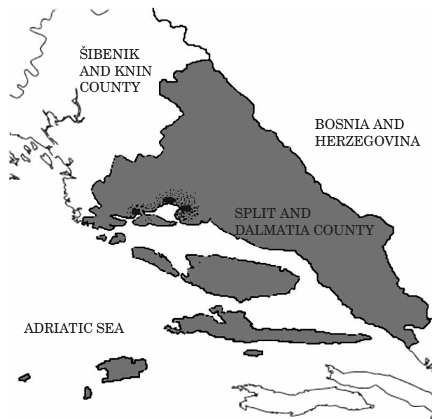
Fig. 2. Geographical distribution of malignant pleural mesothelioma in Split and Dalmatia County during 2000–2007 select period. Black rectangle – shipyard, Black ellipse – asbestos-cement product factory, Black spot – one patient with malignant pleural mesothelioma who worked in asbestos industry or lived at distance up to 5 kilometres of asbestos industry.

To the knowledge of these authors, this is the first study exploring the incidence of MPM in the Split-Dalmatian County where have been the largest concentration of asbestos pollution in Croatia (two large shipyards, factory of asbestos products and ship breaking yard). It is the second most inhabitant county (out of the 21 Cro-