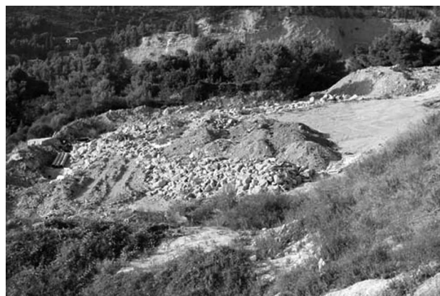
Fig. 4. Unprotected dump with asbestos waste on the hills located several kilometers from asbestos factory.