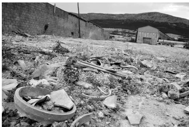
Fig. 3. Unprotected asbestos waste dumped in factory yard.