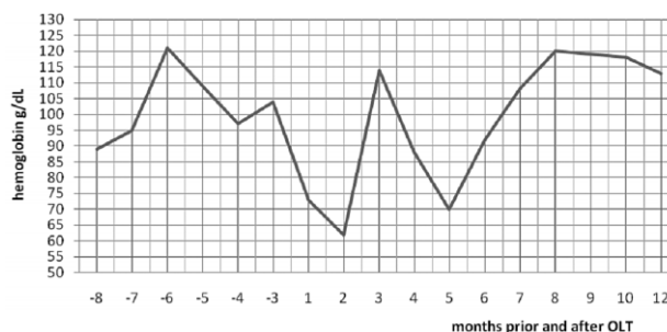
Fig. 2. Hemoglobin levels pre- and post-OLT. Therapy with red blood cell transfusions and repetitive IVIG cycles (0,4 g per kg) resulted in recovery of erythropoiesis demonstrated by monitoring hemoglobin levels during 1-year follow-up period.

Anemia is a frequent problem after LT, with its heterogeneous etiology it can be presented as hyper-regenerative due to blood loss or haemolysis or hypo-regenerative due to myelotoxic drugs or infectious agents or combination of both types. One of hypo-regenerative anemias is a pure red cell aplasia (PRCA) characterized by the inhibition of erythropoiesis in bone marrow. It can be heredi-