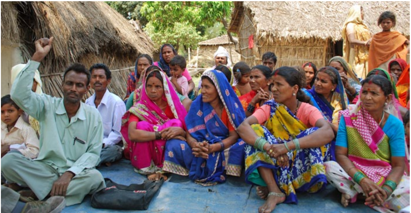
A community gathering with activists and Crowley team members in Banke District.

Official figures on landholdings are outdated and do not cover the entire country; information gathered from interviews with landless people living in the central and western Terai and Hills Districts do provide some understanding of the link between landlessness and violations of fundamental human rights. The interviews conducted as a part of this study suggest that there are two primary negative impacts of the inability to access or control