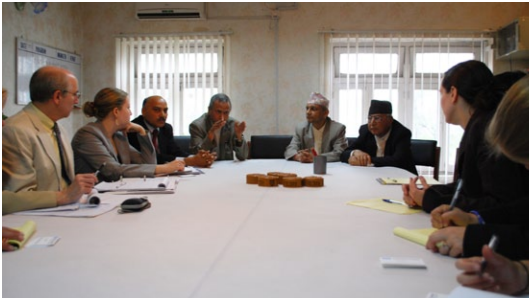
Crowley team members interviewing Nepal Supreme Court officials in Kathmandu. The Court is increasingly hearing socio-economic rights cases, but people living in rural areas remain unaware of what rights they have.