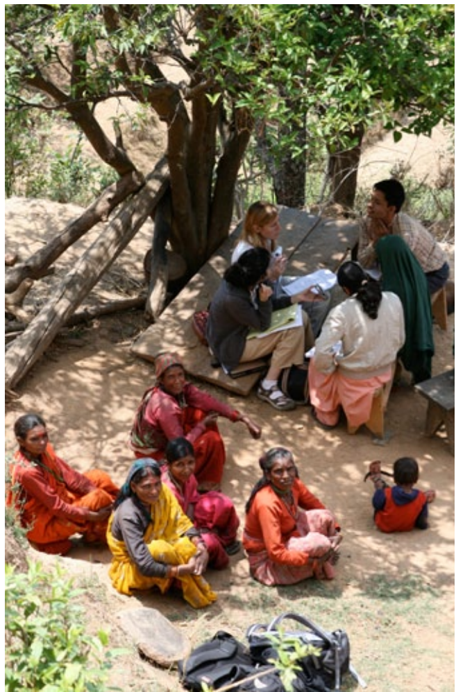
Crowley team members interviewing ex-bonded laborers in Dehilely Village, Dadeldhura District. Villagers said that although they are no longer bonded, their relationship with the landlord remains abusive.

Land redistribution itself was neither well conceived nor well executed especially with respect to the acquisition of land through the lowering of land ceilings. The result was that "[l]and acquired for distribution accounted