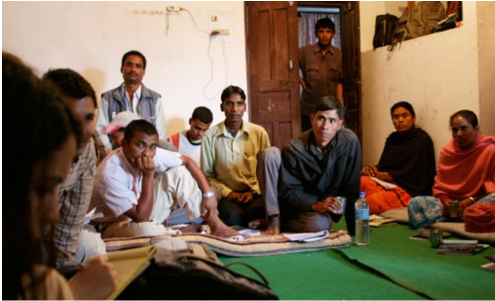
The National Land Rights Forum holds trainings in conjunction with the Community Self-Reliance Center for villagers and farmers throughout the country, like this one in Dadheldura.

growing calls in international documents and by international bodies for states to improve access to land to facilitate human rights protection. Although there are a few basic provisions explicitly affirming that land rights are necessarily linked to human rights, including housing, they are vague in their scope and application. 428 International bodies, however, continue to call on states to increase access to land.