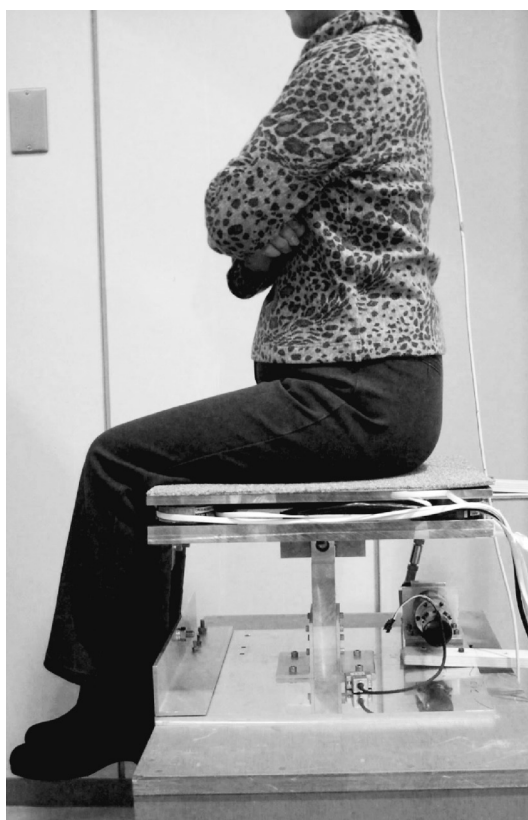
Fig. 2. Participant positioned on the new device during measurements. They didn't touch the floor with their feet.