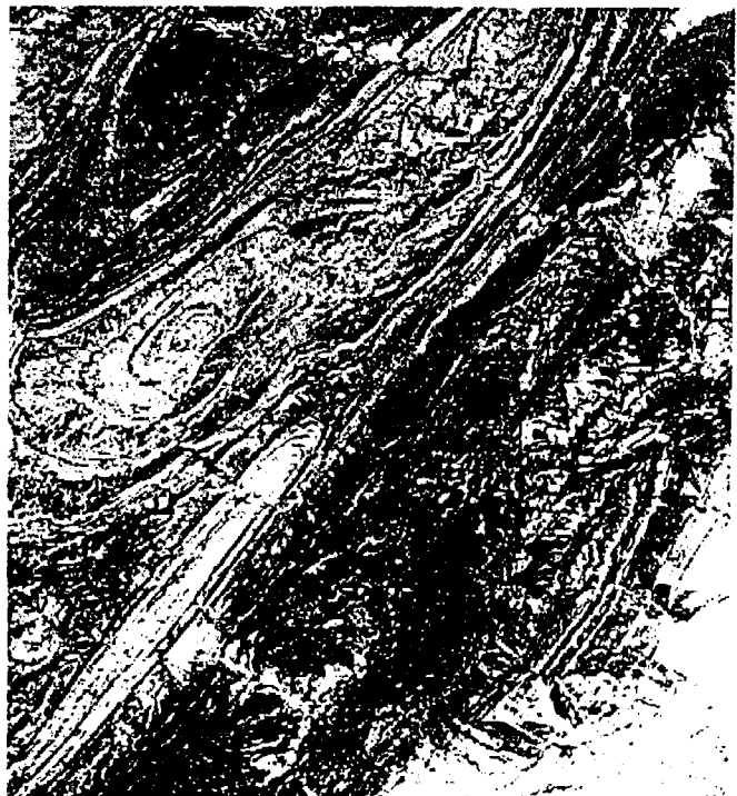
Figure 5 -- Spectrometer image.

The need for geologic mapping of mine areas needs to be improved. The design of mine slopes, the placement of waste dumps, tailings dams, mine roads, etc. is based on geologic maps that show the location, attitude, and character of geologic structures and ore-bearing rock units. However, mine maps can vary greatly in quality and detail due to the subjectivity of various geologists, and the extreme geologic complexity of many deposits. In addition, there are financial and practical limits to the number of geotechnical samples that can be taken for analysis and engineering purposes, so much of the data shown on geologic maps is an estimation by a geologist or a mathematical interpolation of geotechnical results. Figure 5 is a spectrometer image clearly delineating fault areas, folds, and numerous rock types.