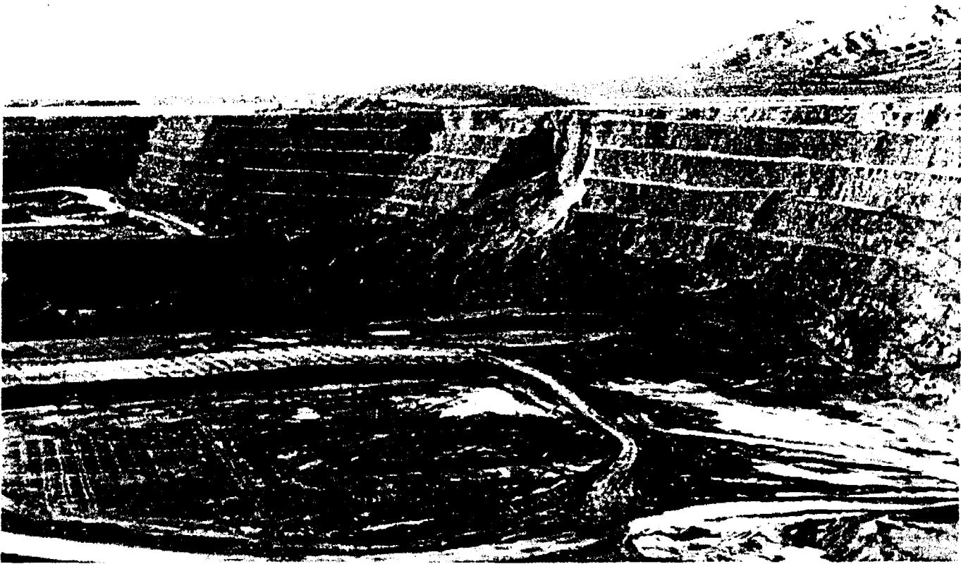
Figure 1 -- Massive slope failure in the highwall of an open pit mine.

while geotechnical designs can be improved to increase factor of safety, and support systems can enhance the overall rock mass strength, even a carefully designed slope may be subject to instability. The objective of this paper is to briefly introduce the most common slope monitoring systems currently in use, describe the limitations of these systems, and present new remote sensing technologies that may be applicable to advanced monitoring and design of dumps, highwalls, tailings dams, and other slopes.