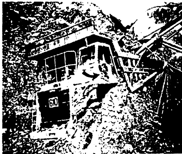
Figure 2 -- Unexpected slope failures endanger lives and demolish equipment.

loading, pore pressure effects, and many other factors can cause instability even in a "safe" slope. The fact that a slope is designed with some risk of failure must not be viewed as a disregard for safety. As long as the risks are known, and a sufficient, suitable monitoring system is provided, remedial engineering and safety measures can be taken (Call and Savely, 1990).