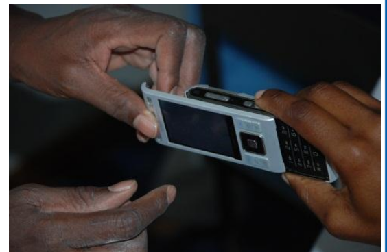
Health providers use a digital camera that is able to take a magnified picture of the cervix.