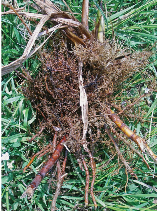
Fig. 5. Roots and rhizomes of Carex randalpina B. Walln.

sional burning during the winter and early spring (Tab. 1). Burning off has a beneficial influence on the community in terms of enriching the species diversity, and the ash provides nutrients. Carex randalpina is a clonal plant, because of which it has features of a successful competitor and dominant plant species (SVENSSON et al. , 2005).