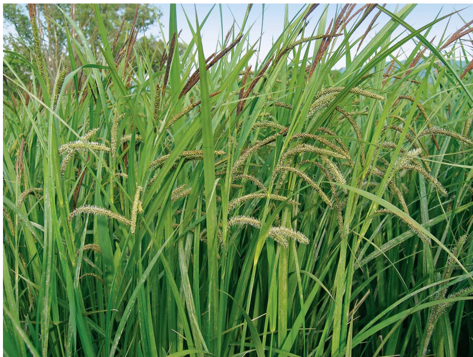
Fig. 4. Specimens of Carex randalpina B. Walln. in inflorescens.

pendulous because of their size (Fig. 4); and by the underground rhizomes, in the fresh state up to 7 mm across (Fig. 5); and roots from 1 to 4 mm thick (Fig. 5). Nevertheless, during any determination it has to be borne in mind that there are also hybrids ( C. xoenensis , C. xoberrodensis ), although they have not as yet been established for the Croatian flora.