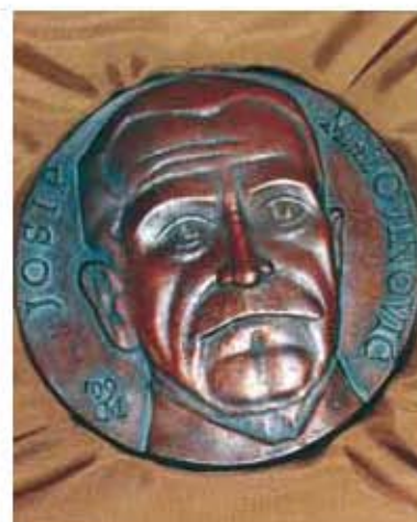
The Josip Matovinić medal

investigations have shown continuous progress in iodine deficiency elimination. Croatia has crossed the path from severe iodine deficiency through moderate iodine deficiency, so that it could reach iodine sufficiency and become one of the countries that have shown best results in resolving this important public health problem. This Symposium has been organized so that the present state could be evaluated and also to focus on another important topic, i.e. the issue of sufficient iodine intake in pregnant women. During pregnancy, iodine requirements increase and it is important for the psychomotor development of infants as well as for the prevention of psychomotor disorders. An important question that still remains unanswered is additional iodine supplementation during pregnancy. There are examples of countries with sufficient iodine intake in the general population while reporting insufficient iodine intake in pregnant women. Also, even if there is adequate iodine intake in pregnancy,