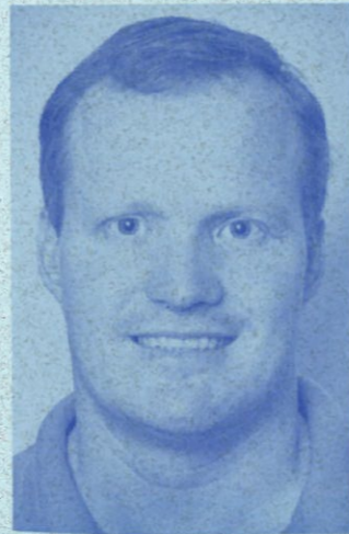
Dr. Kevin M. Murphy Professor of Business Economics and Industrial Relations University of Chicago

Dr. Murphy received his Ph.D. at the University of Chicago in 1986. He was an Assistant Professor (1986-1988), Associate Professor (1988-1989) and has been Professor of Business Economics and Industrial Relations at the University of Chicago since 1989. He is also a Research Associate of the National Bureau of Economic Research.