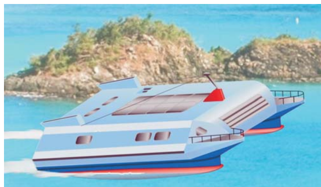
Figure 1 Possible exterior of a "semi-planing" SWA vessel as a motor yacht

As an alternative option of a SWA yacht for high speeds, a novel type yacht of about 50 t displacement was proposed (power 2 × 1.1 kWt), see Figure 1.