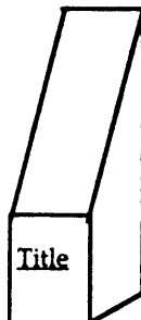
Front View of Cereal Box