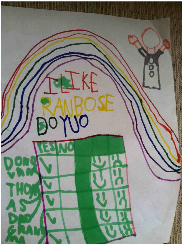
Figure 3. Charting survey data.

types of beans they sorted, or survey their friends to create a chart of who did and did not like the rainbow they saw after the storm (Figure 3).