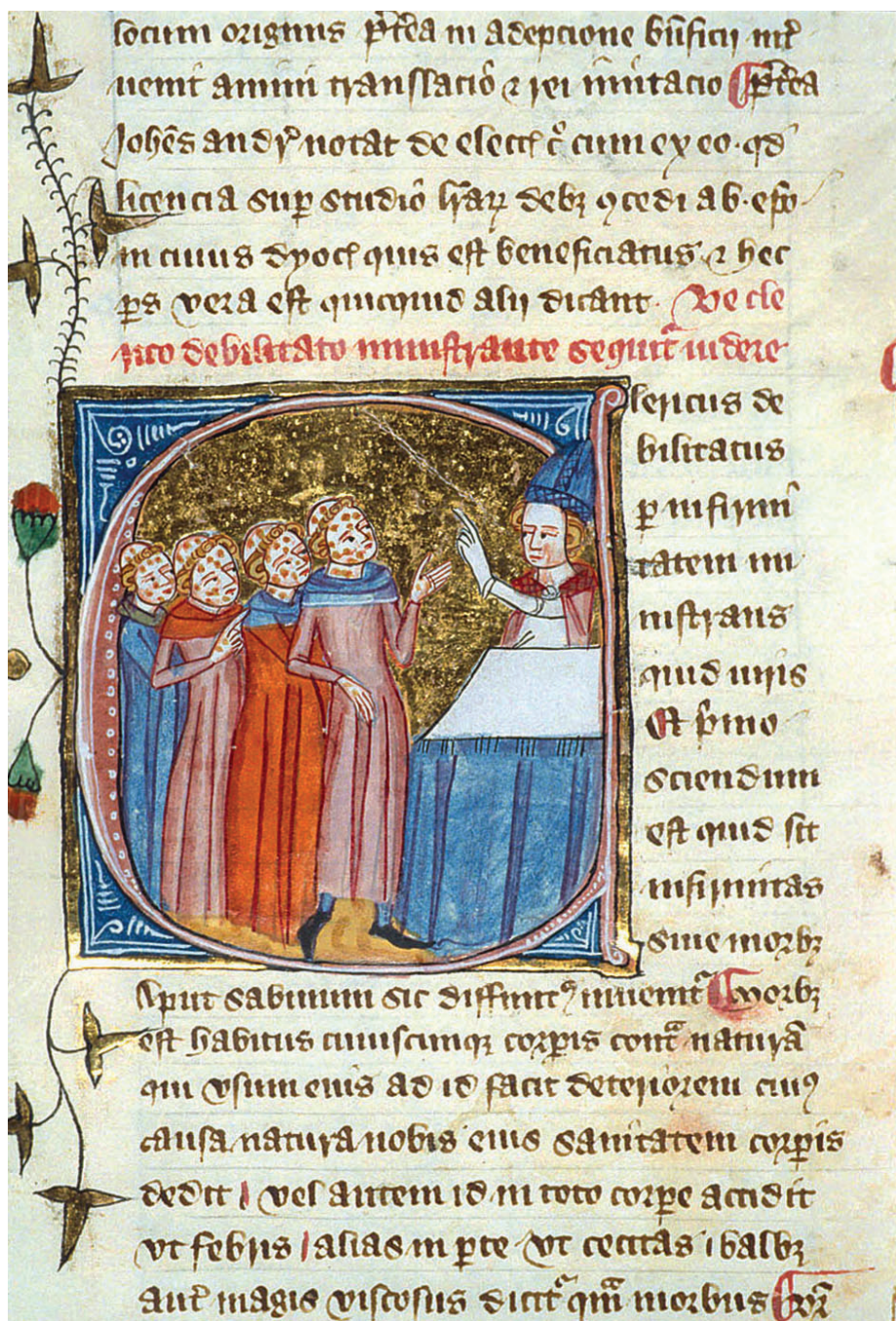
Plate 3. James le Palmer, Omne bonum . London, British Library, MS Royal 6 E VI, vol. 2, fol. 301ra (Detail). Reproduced in accordance with the British Library's guidelines for the reproduction of images in the public domain.