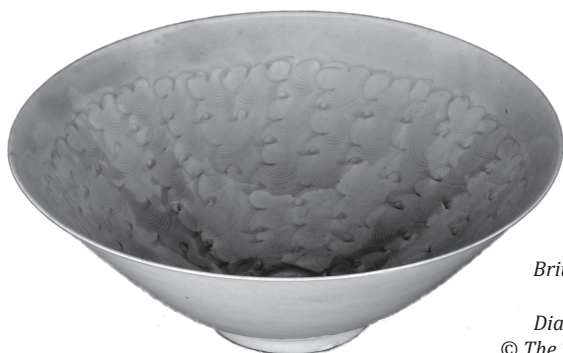
Figure 6. Qingbai bowl with combed decoration, twelfth century.

British Museum, accession number 1991.1028.5. Height: 8.00 cm. Diameter: 21.20 cm. Weight: 400g.