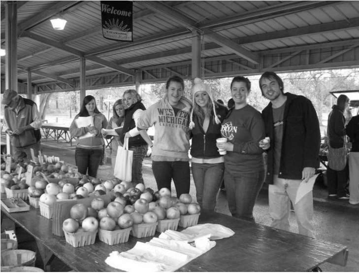
Our students visit the Kalamazoo Farmers' Market in October 2010.