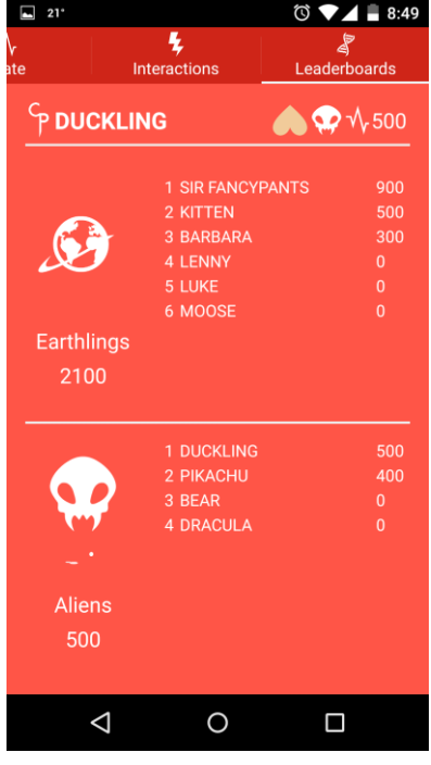
Figure 2. The leaderboards screen, where players can view the best scores of players from each team. The red background colour is displayed for turned players.

CHI PLAYGUE gameplay has the potential to evolve rapidly. The population begins as healthy members of the Earth faction; however, a small portion of players are randomly selected to be infected. The outbreak is handled by the server backend. The initial infection is invisible, so these players have a chance to unknowingly spread the infection. After six hours, silently infected players progress to a visibly sick state. Those that have interacted with these players, then find themselves in an uncertain situation. As interactions continue to occur, the infection and the cure both possess the potential to spread rapidly through the population. Players can adopt different social strategies lead their team to victory, as described by Tondello et al. [4].