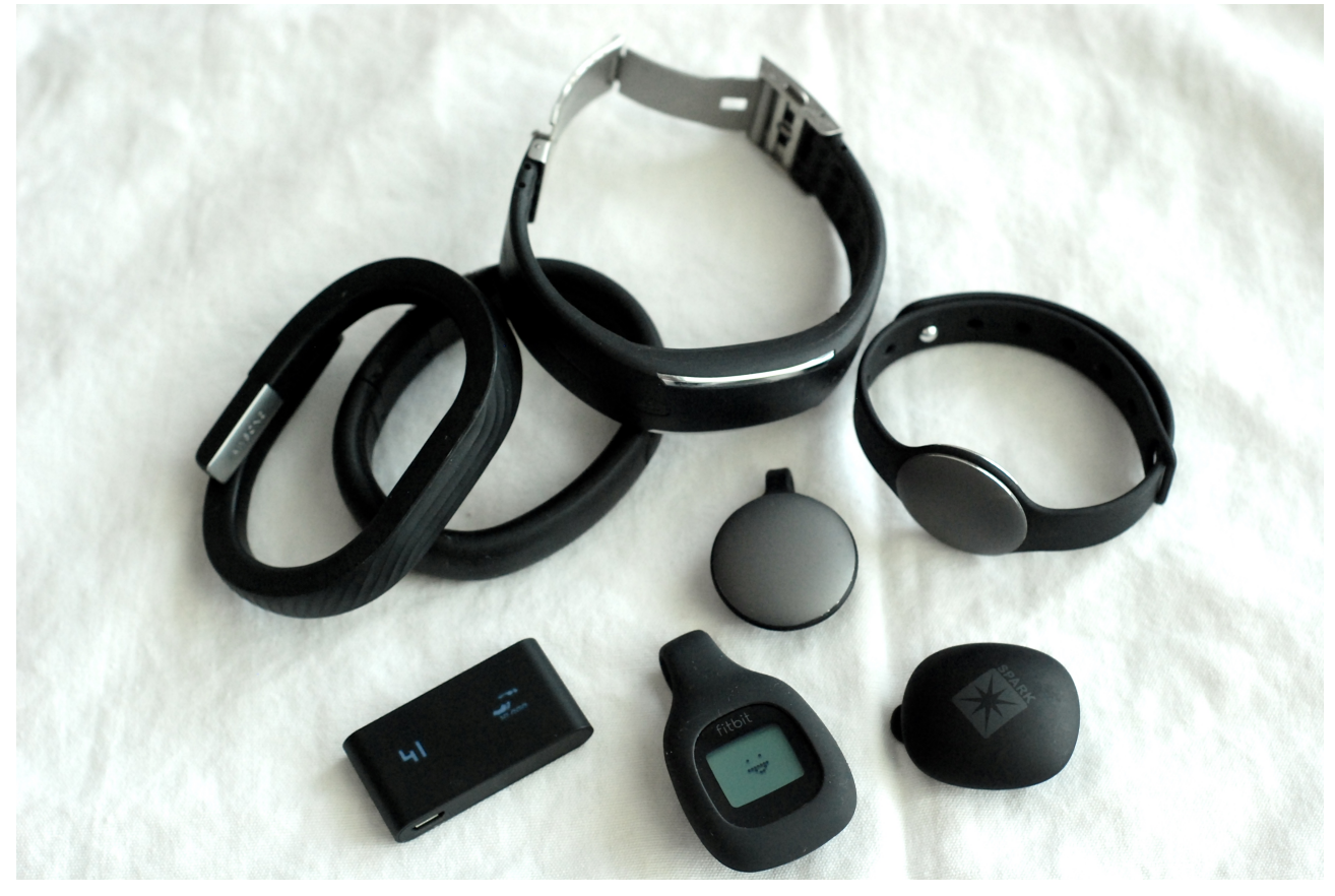
Figure 1. Wearable fitness trackers. Top L-R: Jawbone UP24, Nike Fuelband, Polar Loop, Misfit Shine with sport band . Centre: Misfit Shine with action Clip. Bottom L - R: Withings Pulse, Fitbit Zip, Spark Activity Tracker.

via a separate mobile device or personal computer. We considered a device to be a wearable activity tracker if it contained an accelerometer and connected with a mobile platform. The device also had to be able to be wirelessly paired with handheld or desktop computers with at least Bluetooth 2.0 and be compatible with either Android 1.6+ or Apple's operating system iOS 6.0+. The following wearable activity trackers were evaluated for BCT content: Misfit Shine, Fitbit Flex, Jawbone UP24, Withings Pulse, Nike+ FuelBand SE, Polar Loop, and SparkPeople (Figure 1).