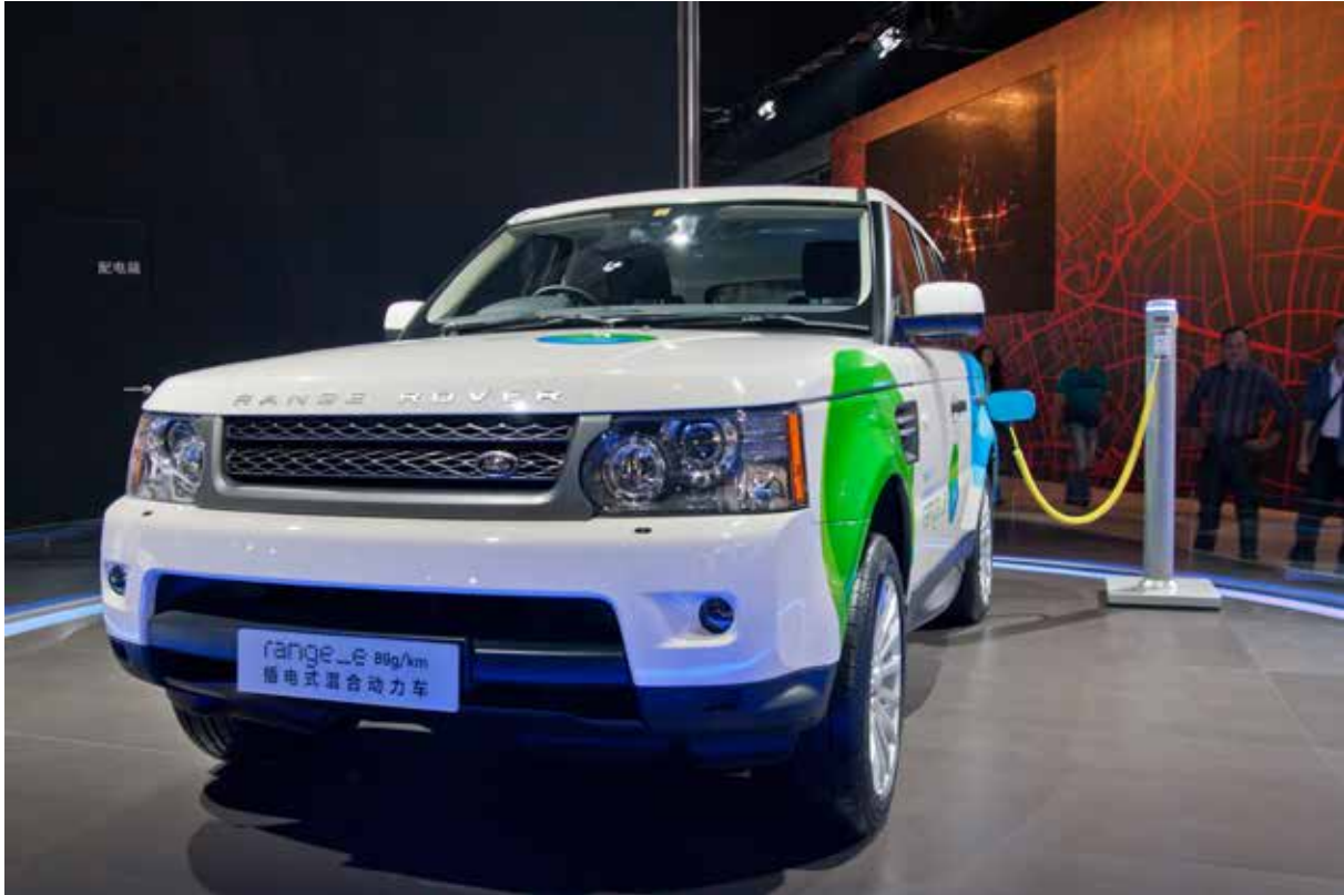
An electric vehicle on display at the 9th China International Automobile Exhibition, on November 25, 2011 in Guangzhou, China.