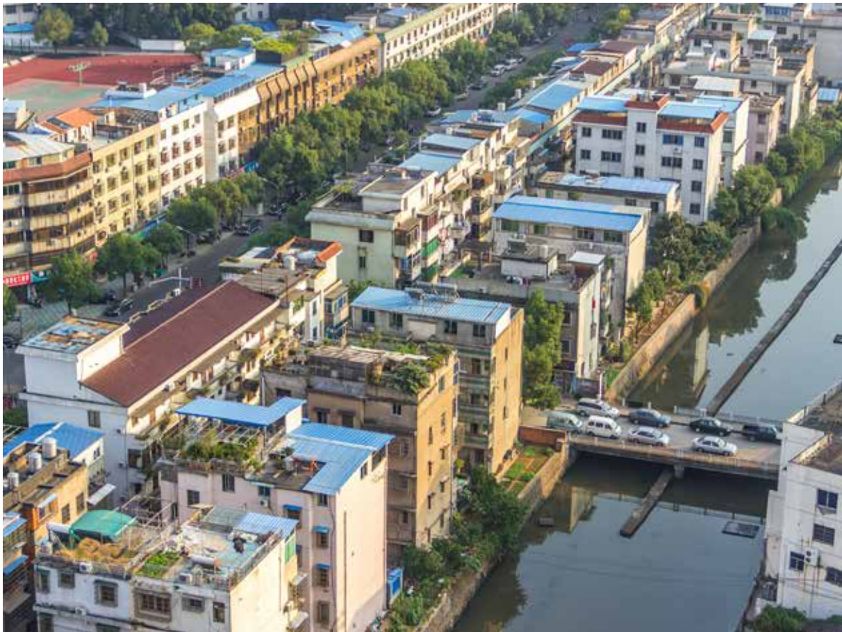
City of Yiwu, Zhejiang, China.