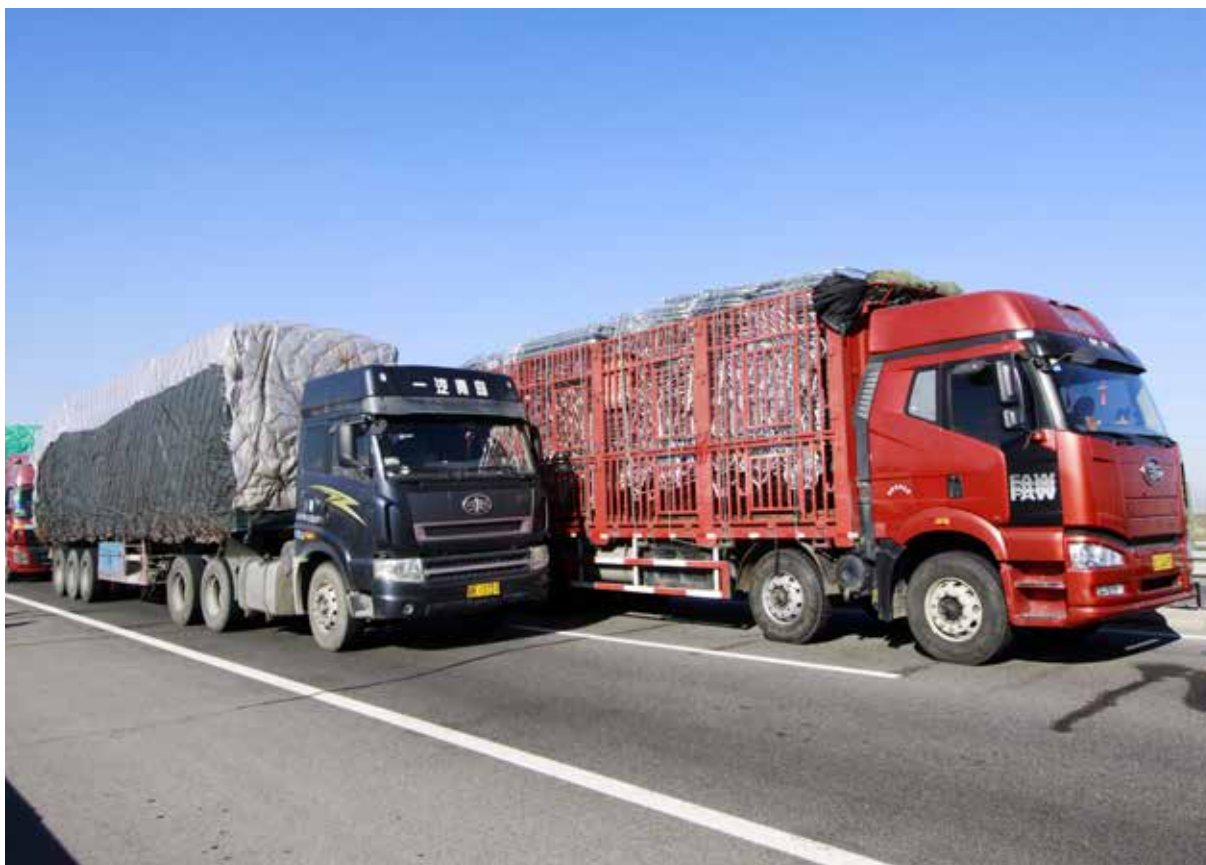
Heavy duty trucks stopped on the highway because of the traffic jam, on December 9, 2013, Tianjin, China.

More than 90% of total HCV fuel consumption comes from trucks, i.e. heavy cargo vehicles. In order to promote energy conversion in China's transportation sector, reduce fuel consumption and guarantee energy security, the fuel economy of trucks must be regulated from the side of production so as to continuously increase the efficiency level of vehicles during the actual operation process from the source.