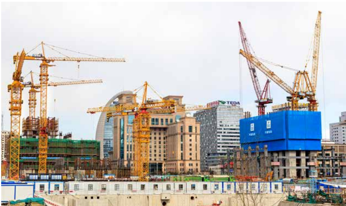
On-going construction are seen around Beijing Central Business District (CBD).

Financial agency: investment and financial management, business model design.