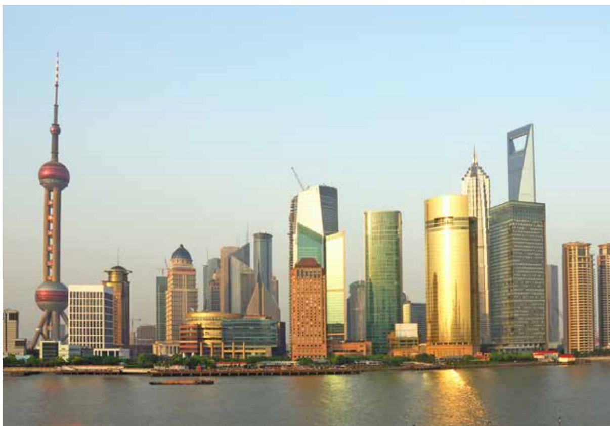
China Shanghai the pearl tower and Pudong skyline at sunset.

In the case of the first PCN, describing the promotion of passive houses, it is estimated that completely adopting passive houses in new buildings by 2030 would reduce energy use by 343 million tce annually (total floor area of new buildings: 30 billion m 2 in the whole of China), with a requirement for an additional investment of 17.88 trillion RMB. In the case of the second PCN, to promote air source heat pumps (ASHPs), it is estimated that completely adopting ASHP technologies would reduce energy use by 60-90 million tce, with a total investment of 1.0-1.2 trillion RMB (6 billion m 2 of existing buildings in the Yangtze River region). Despite the high upfront incremental investment, the potential net present value (NPV) of energy savings during the buildings' use life would exceed the costs set out in both PCNs.