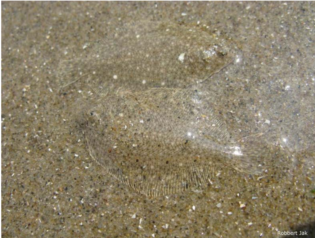
Figure 2. Two young plaice hiding on top of the sediment.