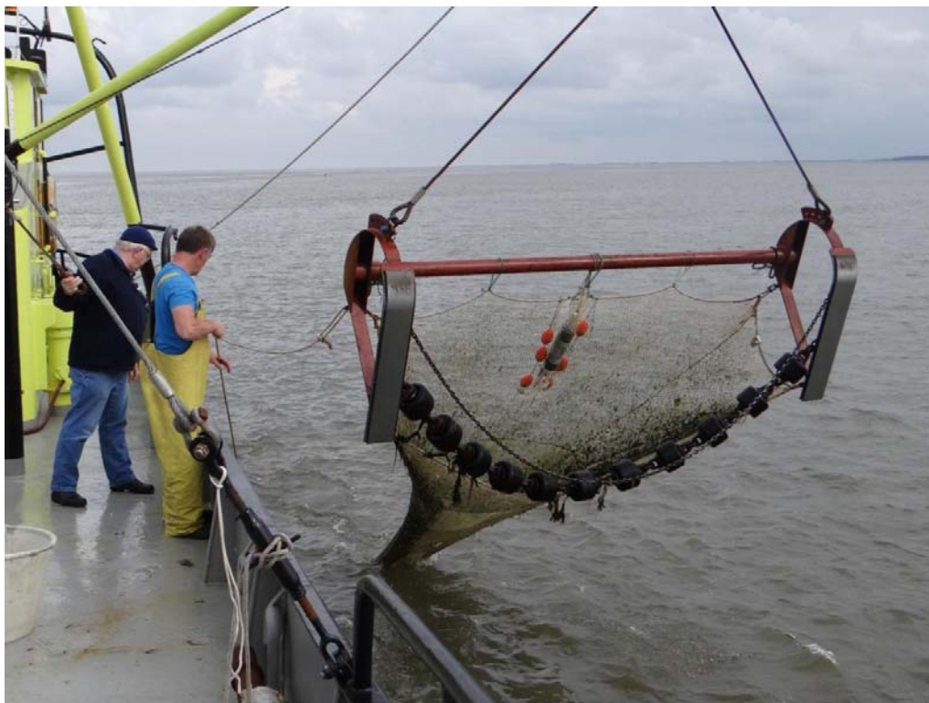
Figure 5. The 3 m beam trawl deployed in the Dutch Demersal Fish Survey.

The beam trawl surveys (Figure 5, Figure 6) revealed a general decline among marine juvenile species since the 1980s, uniformly across all areas ( Annex 2 ). As an exception tub gurnard increased in nearly all areas since 2000. Trends in estuarine resident species were much more variable, both between areas and species.