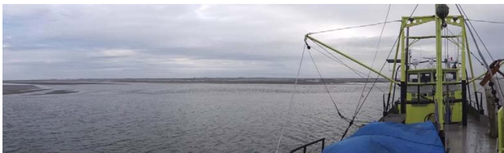
Figure 1. Fishing boat in the Wadden Sea (Photo: Ingrid Tulp, IMARES).

Fish species occurring in the Wadden Sea have been listed previously (e.g., Witte and Zijlstra, 1978; Bolle et al., 2009). In this report, focus is set on the status and trends of selected fish species, typically found in the Wadden Sea. Given that the trilateral fish targets are described in an abstract manner and, therefore, cannot be evaluated quantitatively, this QSR-contribution will be restricted to describing and classifying trends in a selection of species and functional groups.