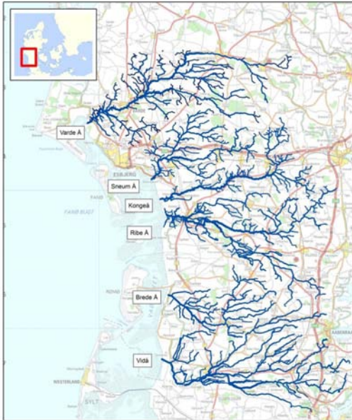
Figure 4. Map of the main Danish Wadden Sea rivers (names in boxes, Å means river in Danish) included in the Danish freshwater monitoring programmes.