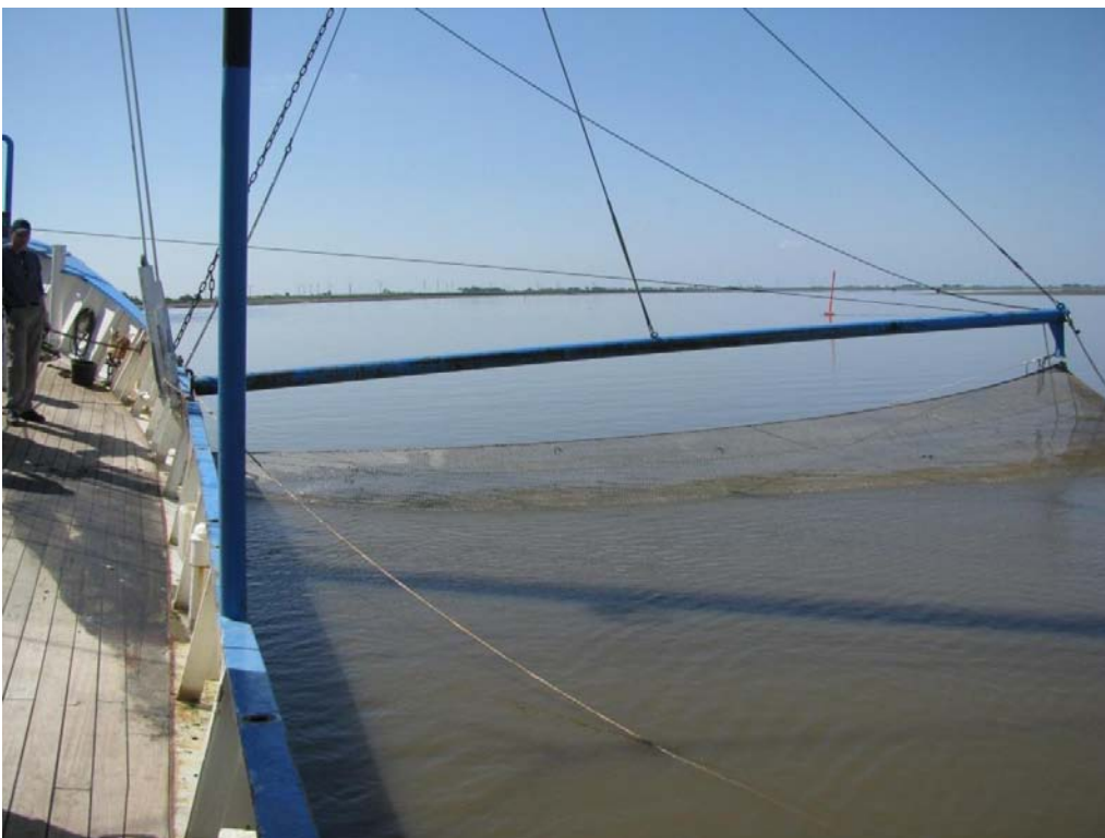
Figure 8. Stow net fishery on the Ems estuary.