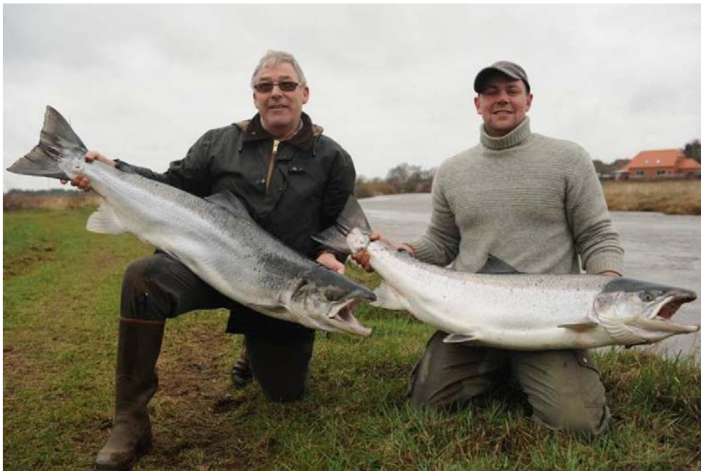
Figure 11. Salmons ( Salmo salar , approx. 18 kg each) caught on the Varde å in April.

The European eel is globally threatened, also in the Wadden Sea area. The recruitment of glass eels is only a few percent of earlier levels. A small increase/recovery was noted in 2011-2015 on monitoring stations in Denmark, but the one station in the Wadden Sea area has shown no such trend. The population status is very low and there is no sign of substantial recovery. The outmigration of silver eels from the Ribe å is quite low (less than four tonnes per year) and has shown no clear trend.