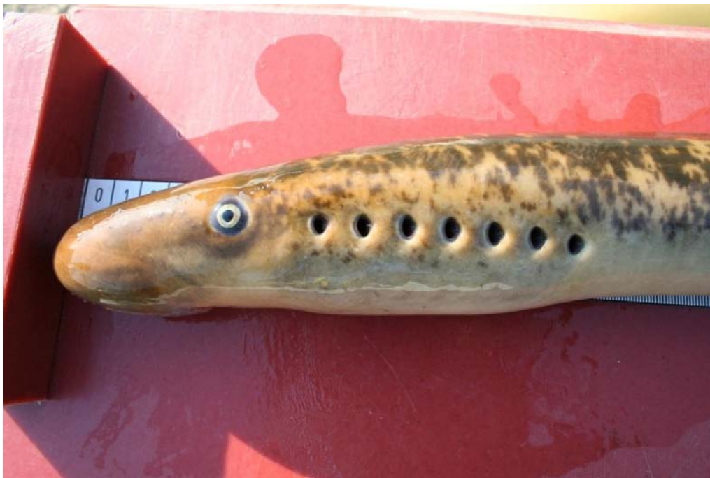
Figure 9. Sea lamprey (Photo: Ingrid Tulp, IMARES).

Pilchard was only caught in the fykes. Catches were highly variable and trends were uncertain in both time-series.