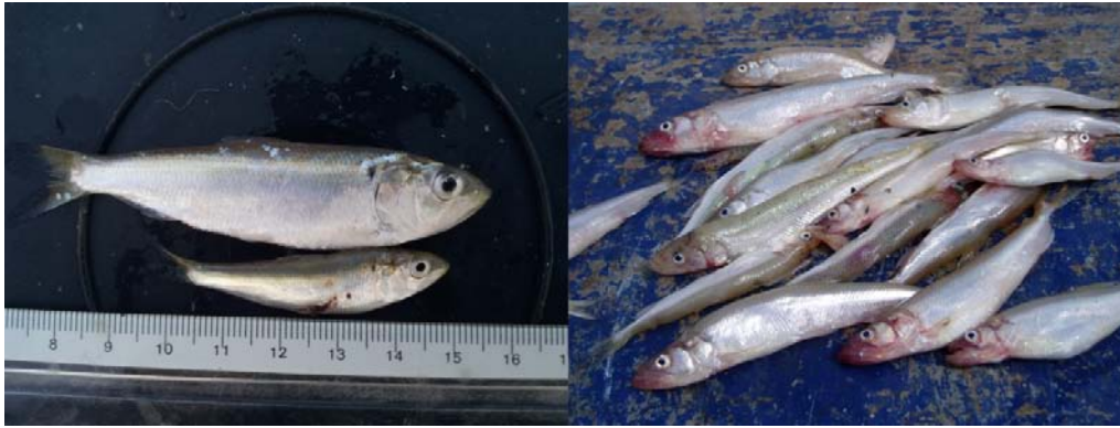
Figure 10. Left (A): Twaited shad ( Alosa fallax ) adult (above) and juvenile (below) caught in the Weser; Right (B): Smelt ( Osmerus eperlanus ) caught in the Weser.