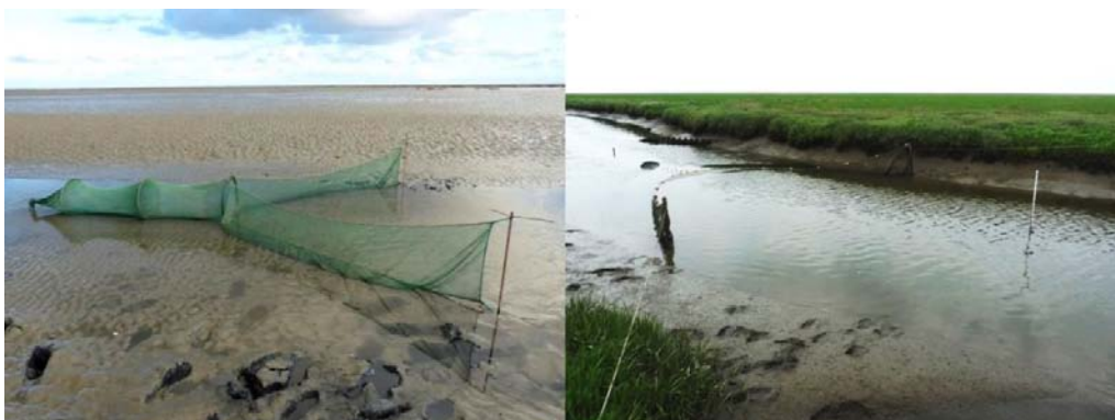
Figure 12. Left (A): Fyke nets positioned in creeks draining an intertidal Pacific oyster reef (Kaiserbalje, Lower Saxon Wadden Sea); Right (B): A salt marsh in Dieksanderkoog

These dedicated research projects on specific habitats provided useful insights into the importance of salt marsh creeks and oyster beds for several fish species, including rarer (endangered) species that may go unnoticed in the standard surveys. The results of such projects deliver basic knowledge on seasonal habitat requirements of fish, such as spawning and nursery habitat. This knowledge is needed in order to evaluate the value of different habitats in the life cycle of Wadden Sea fish species.