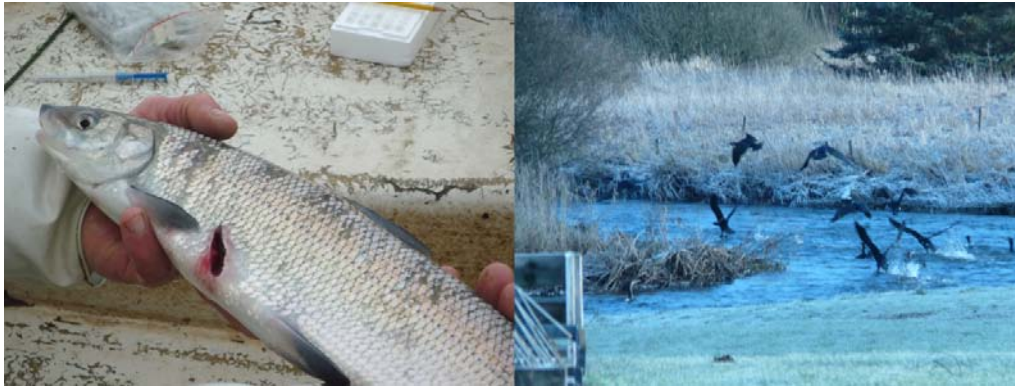
Figure 13. Left (A): North Sea houting with wounds, probably caused by cormorant attacks; Right (B): Cormorant attacks.

The suite of potential factors underlying the observed trends and especially the decline of the marine juveniles also include factors such as habitat change (dynamics in the availability of mussel beds and eelgrass fields), sand nourishments along the coast and North Sea fisheries on adult populations. In several studies correlations between such factors and fish trends were explored but cannot satisfactorily pinpoint the cause of observed trends (Tulp et al., 2008; van der Veer et al., 2015). To identify drivers for developments for certain species, a species specific approach is necessary in which knowledge on physiological and habitat requirements are crucial.