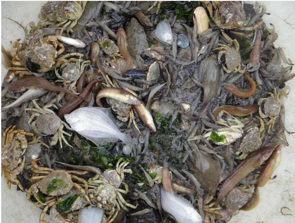
Figure 6. A beam trawl catch in the western Dutch Wadden Sea.