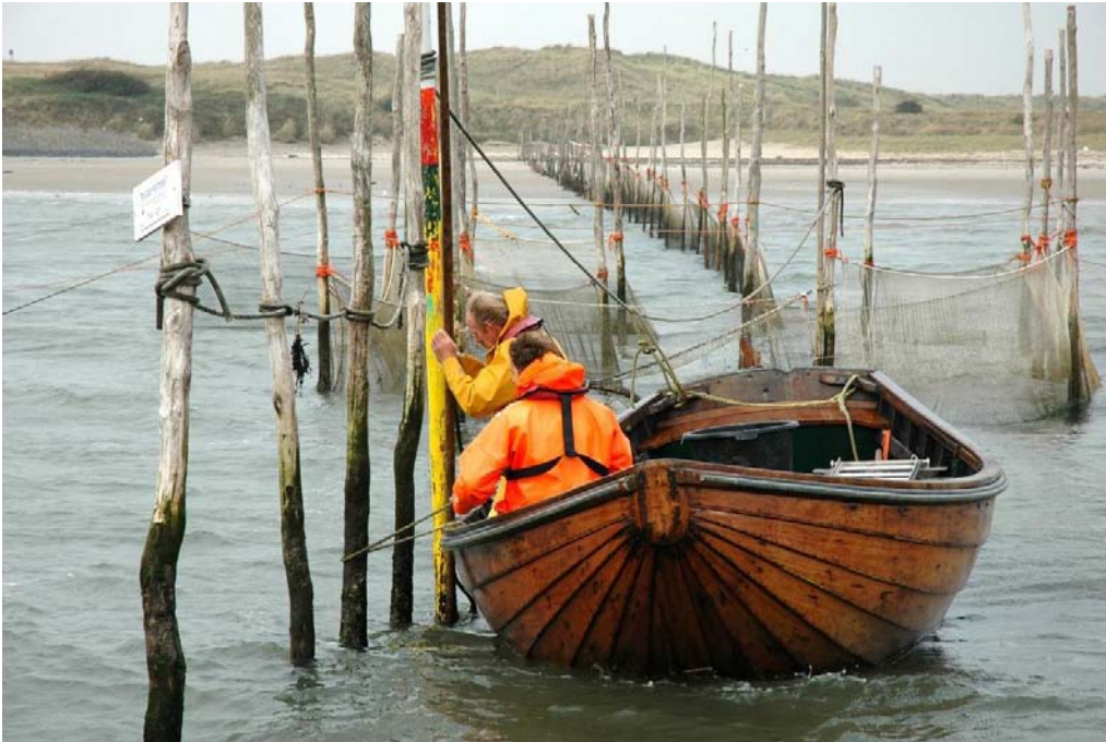
Figure 7. Daily emptying of the NIOZ fyke at the southern tip of Texel in the western Dutch Wadden Sea (Photo: Henk van der Veer, NIOZ).