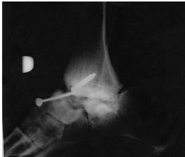
Fig. 2. Lateral radiographs of the ankle 26 months after first operation showed failed arthrodesis.

Ten months after the second operation, roentgenograms showed bone consolidation in the region of arthrodesis (Figure 3). The patient was without symptoms, unrestricted in any daily work. The patient achieved good results ten months after the reoperation.