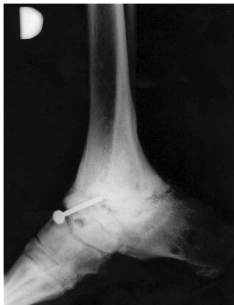
Fig. 3. Lateral radiographs of the ankle 10 months after second operation showed bone consolidation in the arthrodesis region.

Total dislocation of the talus (i.e. tibiotalar, talonavicular and talocalcaneal disruption) is an uncommon injury and has been reported in approximately 0.06% of all dislocations and 2% of all talar injuries 3,4 . It is an extremely rare injury because of its deep position in the foot, the strong ligamentous support and the amount of force required for its dislocation 5,6 . Total talar dislocation is usually an open injury 5 . The talus is predisposed to dislocation because of its anatomical characteristic: it is the only bone in the lower extremity without muscle attach-