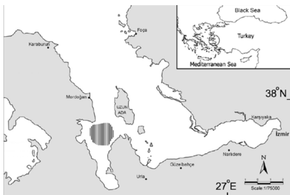
Fig. 1. Sampling locality of Serranus hepatus in Izmir Bay (shaded zone indicates the bottom trawling ground)

The results of otolith readings are given in Table 1. A total of 45 specimens could not be aged. The dominant age group was 2 years