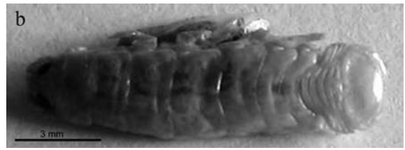
Fig. 1b. A female Ceratothoa parallela , found in the branchial cavity of Scorpaena porcus from the eastern Adriatic Sea

on the caudal fin of a juvenile S. porcus , collected in Čiovo archipelago. A second N. orbigny specimen, of body length 18 mm and 9 mm width was found at the base of the dorsal fin of a female S. porcus , from the south Adriatic in January 2007. In February and April 2007, 3 specimens of N. orbigny were found on the caudal fin of one juvenile and two male S. porcus specimens on the site in the middle Adriatic (Fig. 1a).