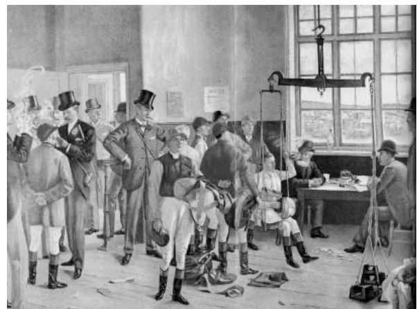
Picture 3. The principle of 'handicapping' was introduced in horse racing - and other sports - to ensure equilibrium of chances between competitors of different weight categories. This picture of "The weighing room", where jockeys are 'matched', appeared in the Illustrated London News of 1893.