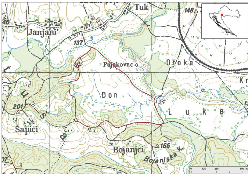
Fig. 1. Geographical position of the Đon Močvar Botanical Reserve. Borders according to Natura 2000.

Two specimens of A. alsine were found during the study of the Đon Močvar peatland. The first specimen was observed in an alder forest – transitional peatbog ecoton ( Carici elongatae-Alnetum glutinosae – Drosero-Caricetum stellulatae ) on 26.08.