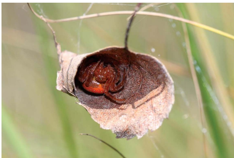
Fig. 2.A & 2B. Araneus alsine (Walckenaer, 1802) (adult female), Đon Močvar Botanical Reserve peatland, Blatuša, Gvozd. leg. V. Šegota