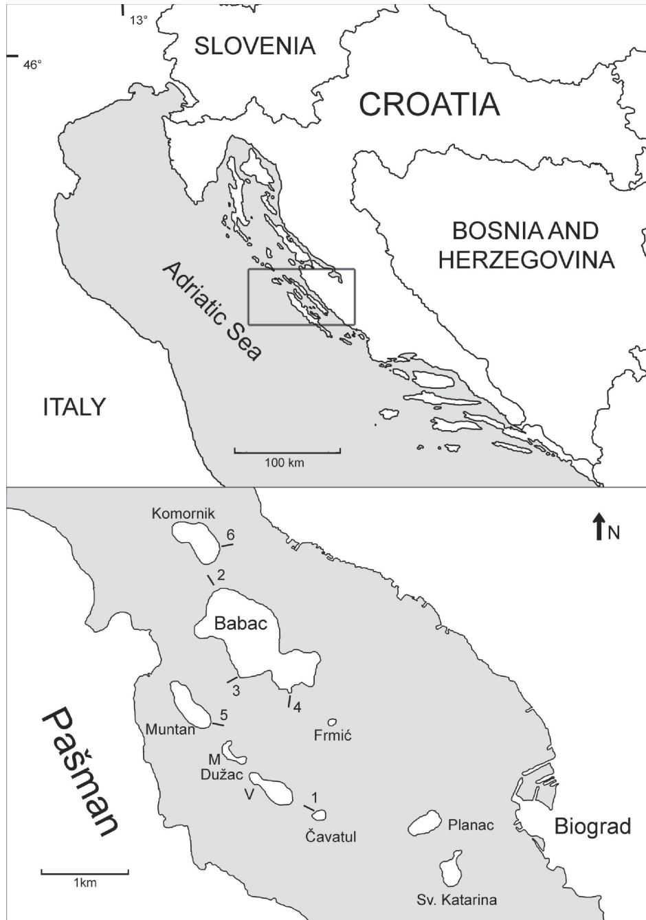
Figure 1. Map of Pašman channel with sampling transects Slika 1. Karta Pašmanskog kanala s naznačenim profilima uzorkovanja