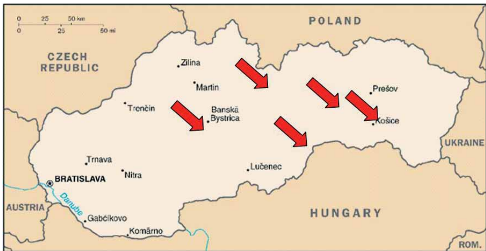
Fig. 1. Localities in Central and Eastern Slovak Republic – origin of samples of cloven-hoofed game.

In total, seventy one cloven-hoofed game animals of different ages were examined for Sarcocystis spp.: 14 red deer (5 male, 5 female, 4 calves) age range 1–2 years, 13 roe deer (8 male, 5 female) age range 1–10 years, 8 fallow deer (4 male, 4 female) age range 2–7 years, 10 mouflons (3 male, 4 female, 3 lambs) age range 0.5–5 years, 6 chamois (2 male, 2 female, 2 lambs) age range 0.5–7 years, 20 wild boars (8 male, 5 female, 7 piglets) age range 0.5–2 years.