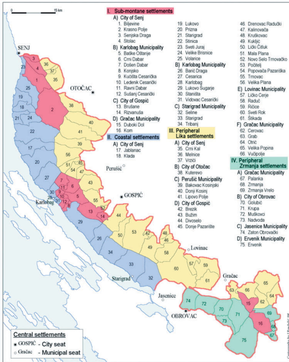
Figure 1. Spatial layout of analysis of demographic development indicators in Velebit Nature Park.

nance wherein the populations were and today still are a vital factor in use of spatial resources, landscape formation and environmental impact in the Park, while their cultural landscape is compatible with the protected area.