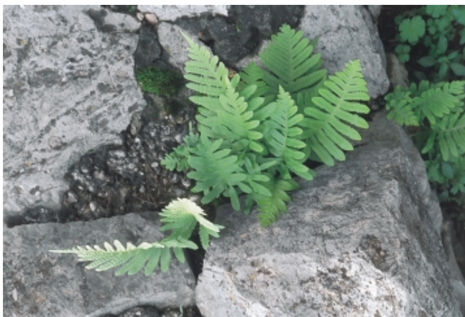
Polypodium cambricum L.