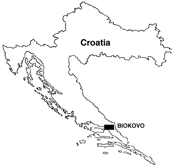
Fig. 1. Map of Croatia with the position of the Biokovo mountain

P. aculeatum (L.) Roth (= P. lobatum (Hudson) Bast.), Dryopteris filix-mas (L.) Schott, D. pallida (Bory) C. Chr. ex Maire & Petitmengin subsp. pallida .