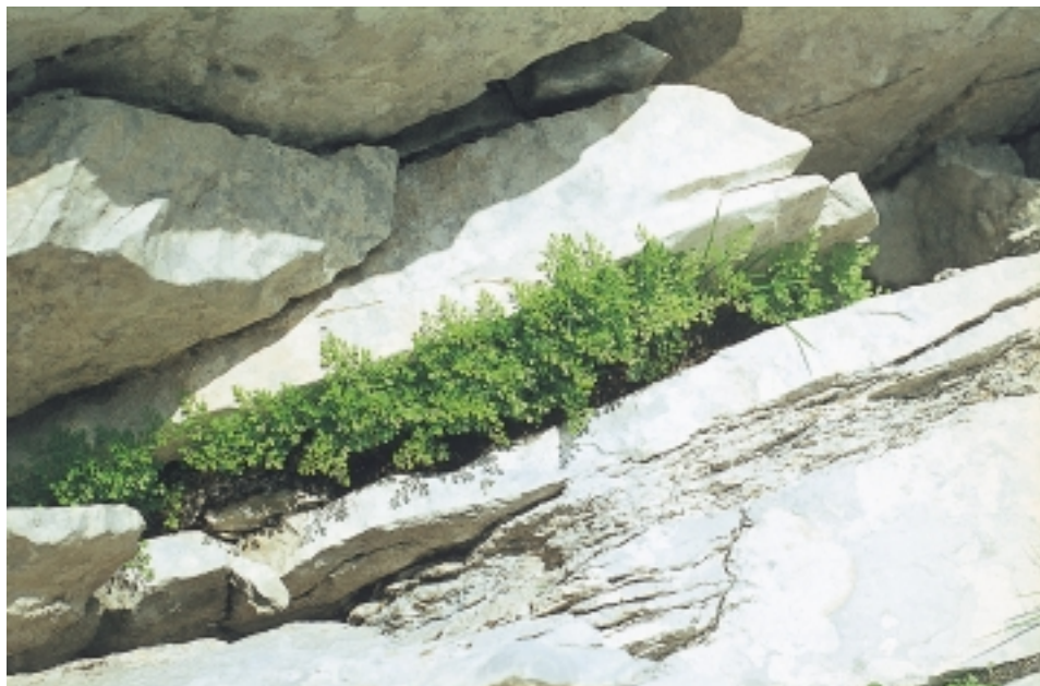
Asplenium fissum Kit. ex Willd.