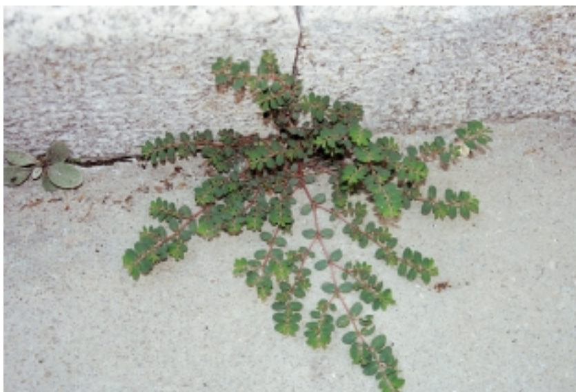
Fig. 1. Euphorbia prostrata Aiton, a plant in the fissure of stone stairs (Šibenik, Gorica)

During research into the flora of Šibenik and the surroundings (1997–2000), Euphorbia prostrata (Fig. 1) was found in several localities in the area of Šibenik (Gorica, Centar, Obala, Vanjski, Vidici and Mandalina) and its surroundings