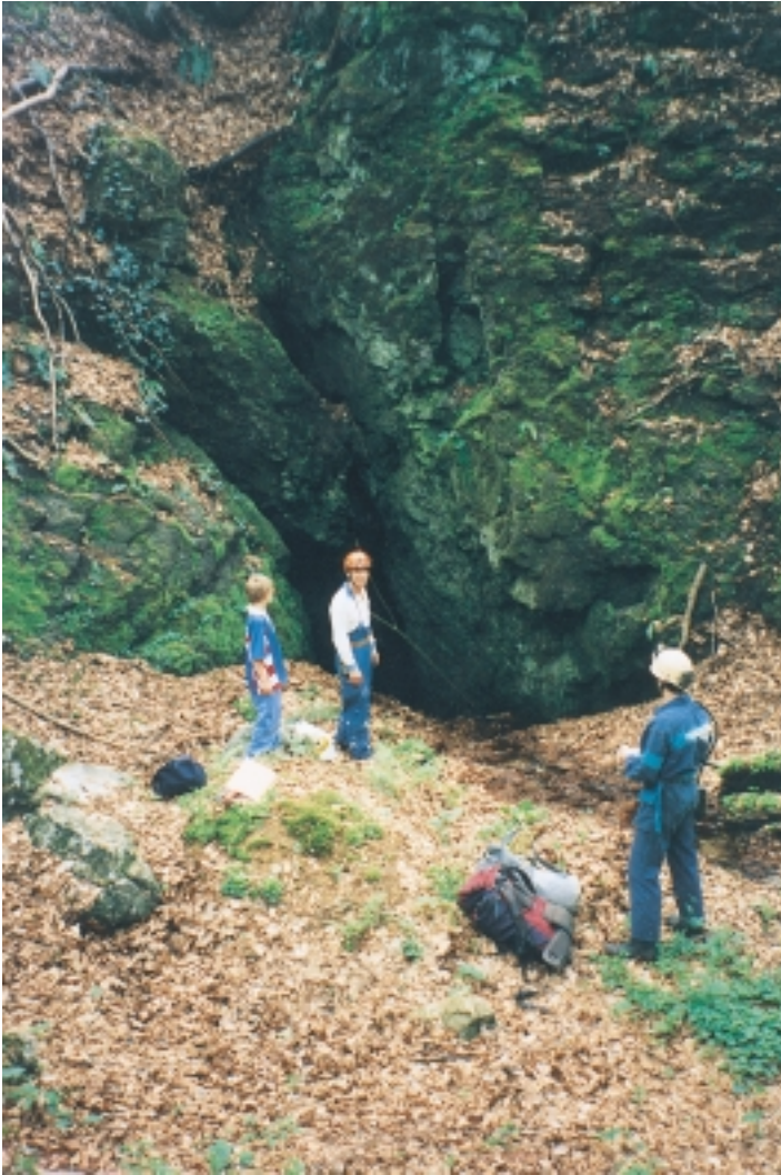
Fig. 1. Entrance of the 20 m deep ponor (swallow-hole) Uviraljka, wintering site of Myotis dasycneme on Mt. Papuk, Croatia.

dasycneme in the list of mammals of this region without giving new informations on the occurrence of this bat.