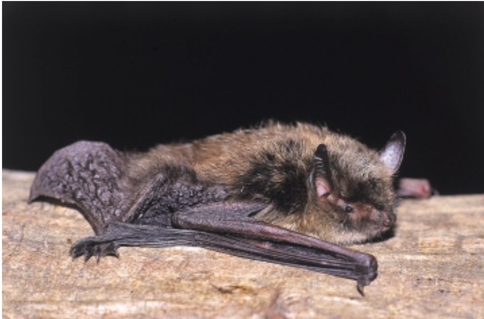
Fig. 2. Pond bat Myotis dasycneme from Uviraljka ponor, Croatia.

For two reasons Mojsisovics' data must be taken with caution. As the author did not mention the exact locality of his observations it remains unclear whether he saw these bats in today's Hungary or today's Croatia. Since there are no voucher specimens that confirm the species identity (MEHELY 1900) he could have seen an other species as well. We doubt that he could have recognised Myotis dasycneme in flight without catching it. Nevertheless, in later publications (PASZLAWSZKY 1918, TOPAL 1954, DJULIĆ 1959, DULIĆ & TORTIĆ 1960, DULIĆ & MIRIĆ 1967, HORÁČEK & HANÁK 1989) the place-names mentioned in the title of MOJSISOVICS (1884) Bélye and Dárda, now Bilje and Darda in Croatia, were wrongly used as localities in which Myotis dasycneme was recorded in Croatia. Only ĐULIĆ (1994) removed the pond bat from the list of bat species recorded for Croatia.