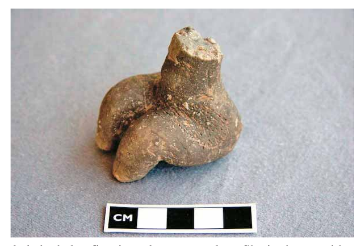
Figure 4. A female baked clay figurine, almost complete. She is shown with a cloth across her lap, indicated by incised marks. The incisions have been filled with red paint (scale 5 cm).

bone and stone tools. Flint tools and obsidian were only sparsely represented, however, and there was very little marine shell, presumably because the site was some distance inland from the coast. The Impressed Ware pottery was much more varied than expected, and a relatively high proportion of it was decorated in a variety of rough incised patterns. Overall, the vessels were quite large, thick-walled, and simply made. One remarkable find from the basal levels of the Impressed Ware settlement was a largely intact female clay figurine (Figure 4). This piece was remarkably well made, representing a true art object in the quality of its conception and execution. The Danilo pottery was extraordinarily abundant and some of it was decorated exuberantly with incised designs. The obsidian and marine shell came almost entirely from levels of the Danilo phase settlement. Thus, the evidence for maritime contact was largely confined to the Middle Neolithic village.