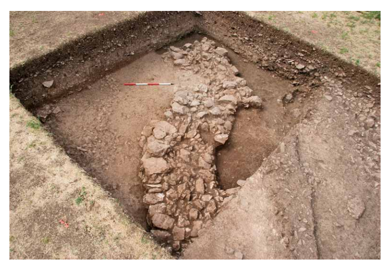
Figure 3. Trench A, from the north. A large, multi-phase, stone wall crosses the trench from north to south (scale 1 m).

bone and stone tools. Flint tools and obsidian were only sparsely represented, however, and there was very little marine shell, presumably because the site was some distance inland from the coast. The Impressed Ware pottery was much more varied than expected, and a relatively high proportion of it was decorated in a variety of rough incised patterns. Overall, the vessels were quite large, thick-walled, and simply made. One remarkable find from the basal levels of the Impressed Ware settlement was a largely intact female clay figurine (Figure 4). This piece was remarkably well made, representing a true art object in the quality of its conception and execution. The Danilo pottery was extraordinarily abundant and some of it was decorated exuberantly with incised designs. The obsidian and marine shell came almost entirely from levels of the Danilo phase settlement. Thus, the evidence for maritime contact was largely confined to the Middle Neolithic village.