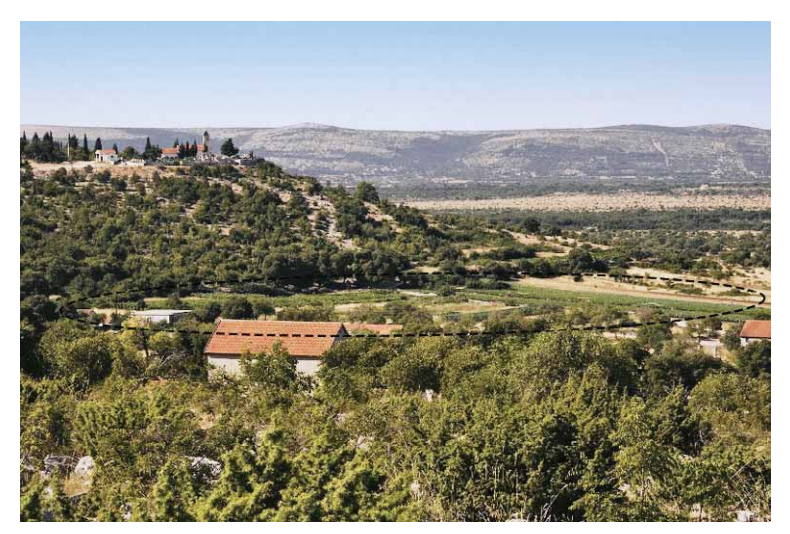
Figure 1. The location of the Neolithic village of Pokrovnik, from the north. The archaeological site lies at the foot of the hill on which the church of Sveti Mihovil stands. The area covered by the site is within the dashed line.