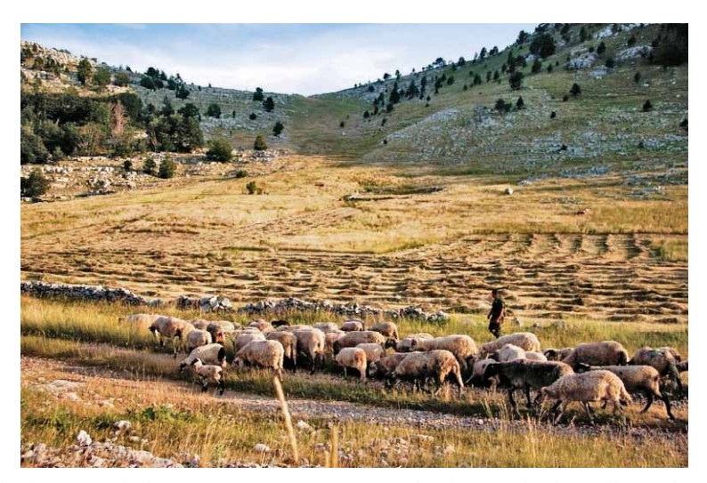
Figure 5. Sheep on their way to summer pastures in the Bezdanka valley, Dinaric Alps.

Transhumance used to be a mainstay of animal husbandry throughout Dalmatia until a generation ago (see for example, NIMAC 1940). Today, a few villages only continue to send their animals, mainly sheep, into the Dinaric Alps for summer pasture. Danilo, though no longer Pokrovnik, is one of those. We spent a day at the shepherd's settlement at Bezdanka, a high valley below Mt. Badanj and north-west of Mt. Dinara, to interview them. They were responsible for a combined flock of 200 animals, far fewer than the many thousands that would have been typical a century ago (Figure 5). The information recovered in the interviews, however, was important for the insights it