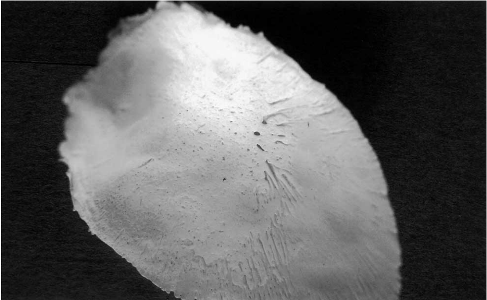
Fig. 1. The squama of the frontal bone consists in the newborn of bony sprouts which display a thin covering by the future lamina vitrea. Lamina displays imprints in shape of holes and furrows corresponding to the differently shaped villi arachnoidales.