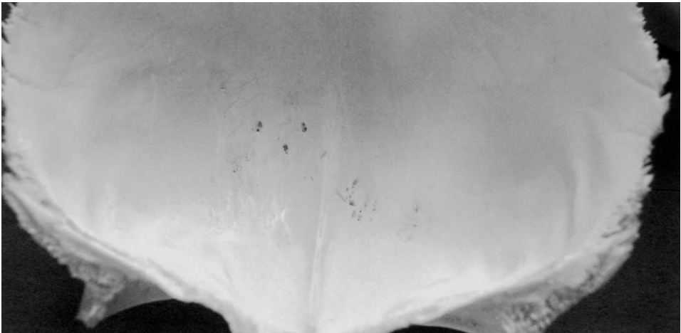
Fig. 2. Foveolae granulares on the inner surface of the squama of the frontal bone in a 3 years old child. They are situated far from sinuses and communicate with diploic space and diploic veins.

3). By intensive agglomeration of the Pacchionian granulations appeared in older individuals on the inner surface of the