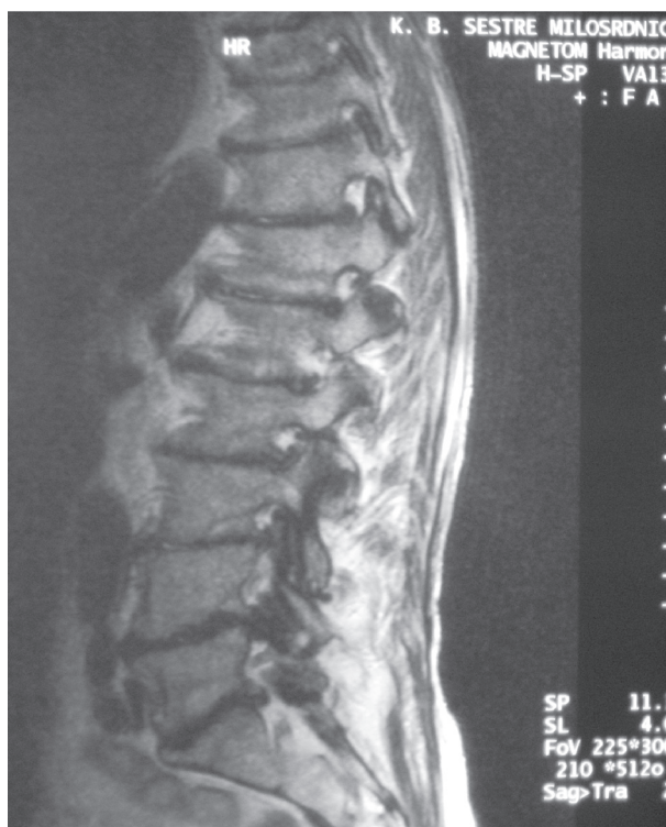
Fig. 4. Spine MRI indicated severe deforming spondylosis, degenerative changes of small joints, intervertebral disks with narrowed spinal canal and extrusion of osteophyte disk complex with reduction of intervertebral foramina in all segments of lumbar spine, especially L5-S1 segment.

(Fig. 3). Magnetic resonance imaging (MRI) of the spine indicated severe deforming spondylosis and de-