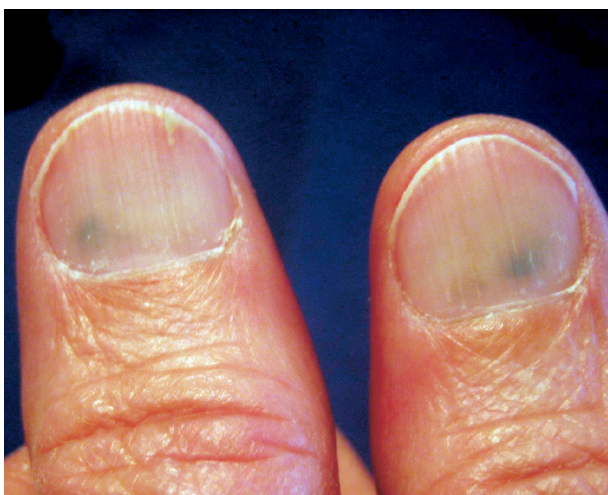
Figure 2. Pigmented thumb nails.

his urine and sometimes his sweat left stains impossible to wash. He confirmed that his urine turned dark on staying on air. From age 57 he suffered chronic pain in his knees, low back and shoulders, especially during the night. His body height had decreased by 10 cm. On physical examination, obvious bluish black discoloration of his sclerae, thumb nails and ear skin was confirmed. Other findings included reduced cervical and lumbar lordosis, painful and increased spinal muscle tonus, kyphosis and muscle atrophy. Chest expansion index was 5 cm and modified Schober test 3 cm. Radiological evaluation of sacroiliac joints revealed bilateral sacroileitis, while spine x-ray showed diffuse advanced axial osteo-articular degenerative changes and severe osteoporosis