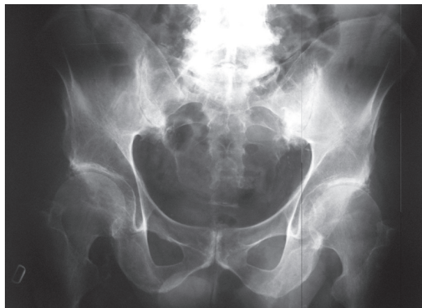
Fig. 3. Pelvis x-ray: mild bilateral hip osteoarthritis, bilateral asymmetric sacroileitis with narrowed intra-articular gap and reactive subchondral symphyseal osteosclerosis.

(Fig. 3). Magnetic resonance imaging (MRI) of the spine indicated severe deforming spondylosis and de-