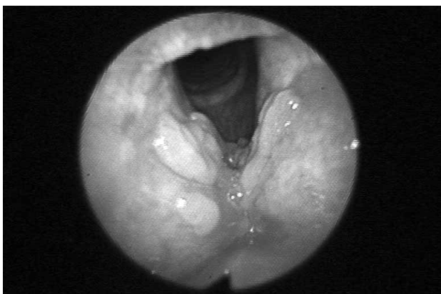
Fig. 4. Laryngeal papillomatosis in a patient whose partner had cervical intraepithelial lesion grade II.

Although visible anogenital lesions are present in some individuals infected with HPV, the majority do not have a clinically apparent disease. Infection with HPV is often asymptomatic, which makes viral detection challenging. Subclinical lesions are actively infectious, because they show active replication of the HPV virions 36,37 .