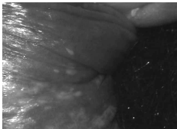
Fig. 6. Multiple condylomata plana (flat warts) lesions in asymptomatic male patient whose female partner had CIN III lesion (view by peniscopy after application of 3% acetic acid).