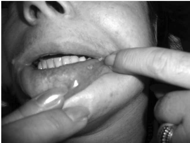
Fig. 3. Oral condylomata acuminata in a patient whose partner had multiple genital warts.