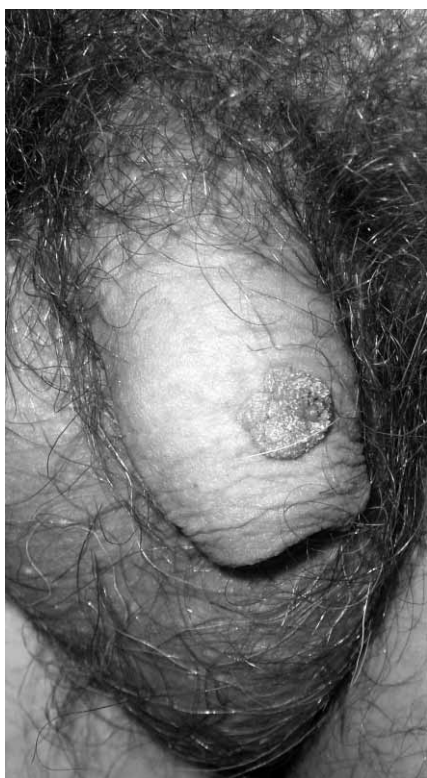
Fig 1. Penile condylomata acuminata.

Recurrent laryngeal papillomatosis (Figure 4) is a rare disease of benign exophytic laryngeal papillomas