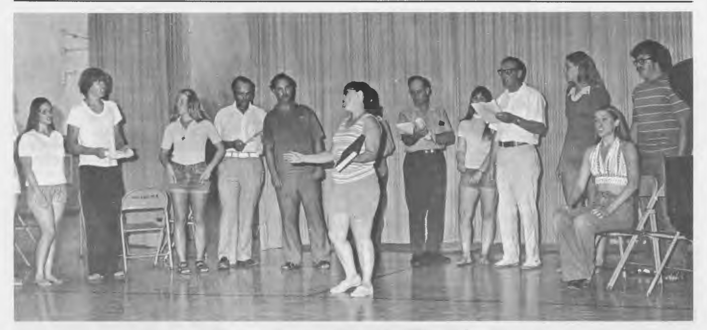
Glenwood Company rehearses for "Elixer of Love."