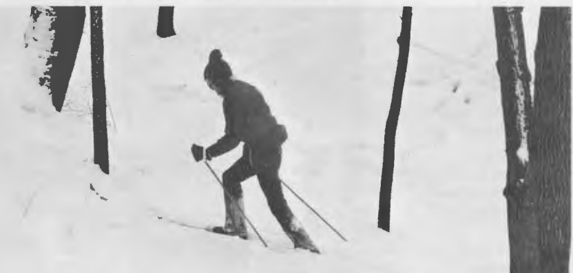
Cross Country Skiing Popular Winter Sport.

If the plan proceeds on schedule, Moorhead State College will look entirely different when the fall quarter opens in 1977.