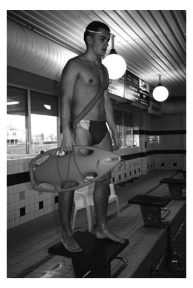
Figure 1. Putting a rescue canister on one shoulder

In other tests (T4 to T13) (Table 4) the distance to the victim to be covered by the lifeguards was 48 metres. The aim of the tests involving simulated rescues without the equipment (T4) and with various variants of the