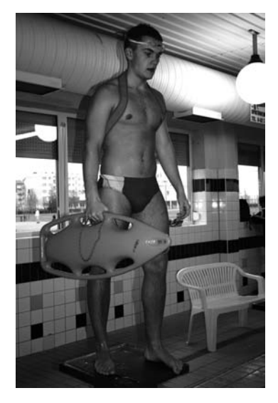
Figure 2. Putting a rescue canister on both shoulders