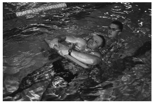
Figure 6. Inverted breaststroke with an armpit tow