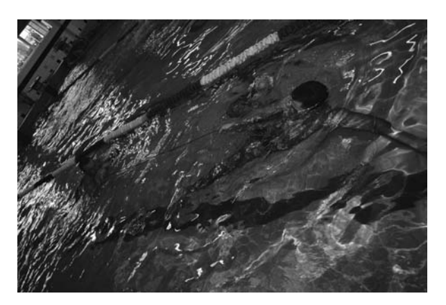
Figure 5. Towing on a long rope