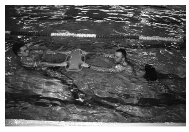
Figure 3. Towing with inverted breaststroke, the victim on his/her chest

At the end, an extra T14 test was carried out. The participants were fourteen lifeguards, including one woman. They performed four tests of towing the victim at a distance of 25 metres, each test with a canister used in a different way (Figures 3-6). Their starting heart rate and post-exercise heart rate were calculated as well as the towing time.