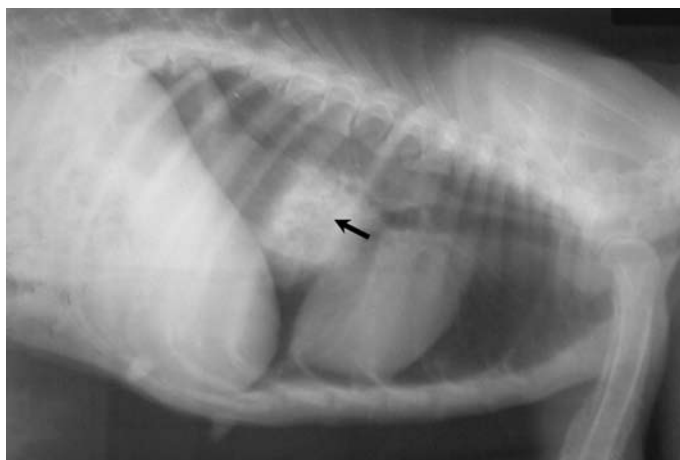
Fig. 2. Left lateral thoracic view of a dog with hypertrophic osteopathy. An oval, radio dense mass located in the caudal thoracic oesophagus, immediately caudal to the heart (arrow).

Clinical findings. Clinical examination revealed pyrexia (40.1 °C), tachycardia (132 beats per minute) and tachypnoea (40 breaths per minute), poor body condition, bilateral mucopurulent ocular discharges and hard, painless swelling of all four limbs. Haematological parameters showed a decreased in Packed Cell Volume of 32% (normal is 37-55%) and neutrophilia at 87% (60-77% is normal).