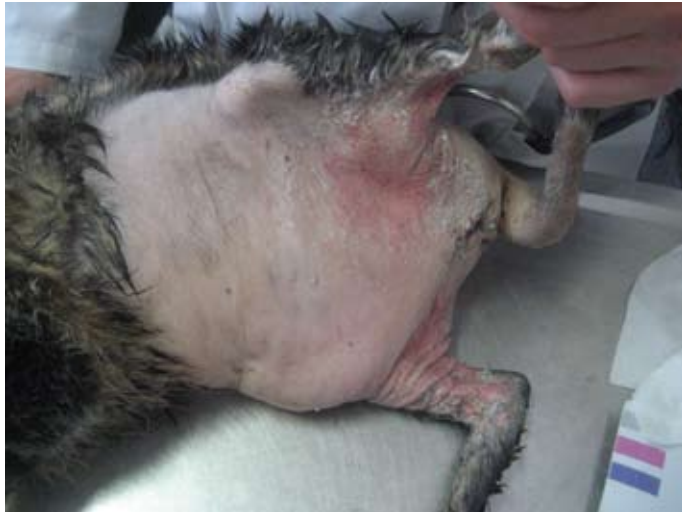
Fig. 3. Five days after initial proceeding

become less dramatic, the lesions involved were less reddish and became dry. On the third day, the cat was better and started eating without manual feeding. On the fourth day the skin lesions were dry. Local therapy (povidone iodine) was maintained and the cat was sent home on day 5 (Fig. 3). Treatment was continued at home by the cat's owner. Control exam was on 10 th day.