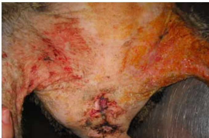
Fig. 1. Abdominal and inner thighs affected skin

exocytosis. Dermis oedema presented with neutrophils diapedesis in vessels (Fig. 2). Also ulceration with fibrin exsudation and degenerated neutrophils embedded inside were seen. The dermis was reactive with numerous neutrophils in vessels (diapedesis).