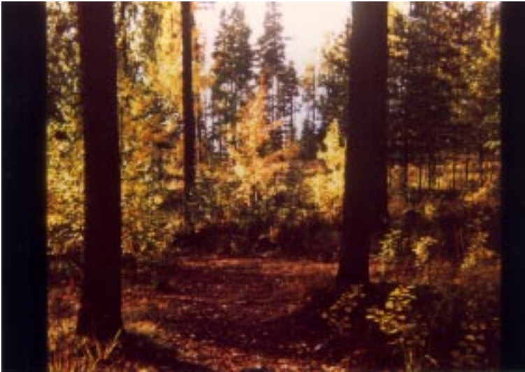
FG. 1. Photo of typical Finnish forest