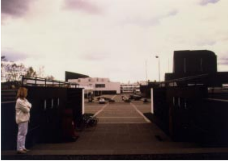
FG. 7. Photo of 'landscape' at Seinäjoki