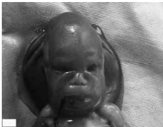
Figure 10. Appearance of aborted fetus from the Figure 9 with hydrops, cystic hygroma and morphological changes of the face

Slika 10. Izgled ploda sa slike 9 koji ima hidrops, cistični higrom i morfološke promjene na licu