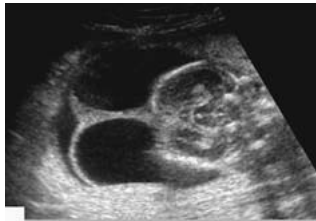
Figure 3. Septated cystic hygroma in fetus with Turner syndrome in the 2 nd trimester of pregnancy

The fetuses with 45,XO Turner syndrome develop in the second trimester severe lymphatic abnormalities visible by ultrasound. The most typical almost characteristic sign is septated cystic hygroma ( Figures 3 and 4 ). Of the fetuses with cystic hygroma 75% have chromosomal