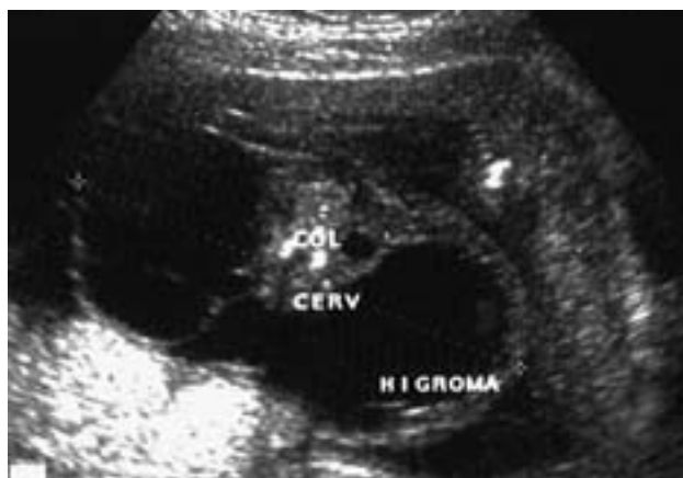
Figure 7. Cystic hygroma in fetus with Turner syndrome at 18 weeks of gestation Slika 7. Cistični higrom u ploda od 18 tjedana s Turnerovim sindromom

abnormalities, and over 95% of them having Turner syndrome. 18 Other echographic findings usually found in Turner syndrome in the second trimester include: lymphedema of the limbs, hydrothorax and ascites (Figure 5). The intrauterine death is usually caused by fetal hydrops with characteristic ultrasound finding resembling space suit (Figures 6, 7 and 8).