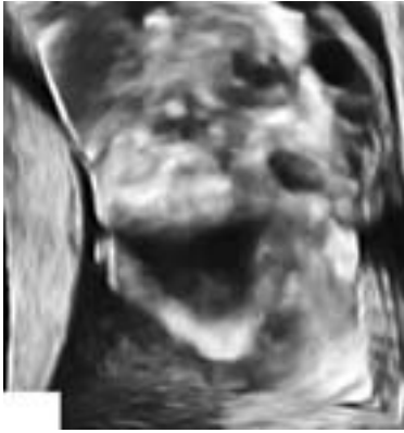
Figure 2. Cystic hygroma in fetus with Turner syndrome. 3D view with clearly depicted septum

Slika 2. Cistični higrom vrata u ploda s Turnerovim sindromom. 3D prikaz jasno vidljivog septuma