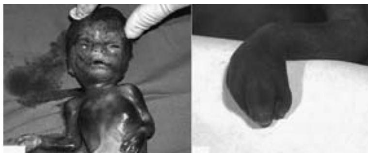
Figure 12. Appearance of aborted fetus with triploidy. Hypertelorism, microphthalmos, micrognathia, facial asymmetry, low set ears, syndactily of the 3 rd and the 4 th finger of the left hand should be noticed

There were several studies presenting detection of structural fetal abnormalities in the first trimester by ultrasound. Malone and al. 21 studied prevalence, natural history, and outcome of septated cystic hygroma in the first trimester of the general obstetric population, in order to differentiate this finding from the simple increased nuchal translucency. There were 134 cases of cystic hygroma (2 lost to follow-up) among 38 167 screened patients (1 in 285). Chromosomal abnormali-