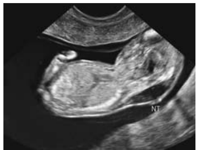
Figure 1. Increased nuchal translucency at 12 weeks of gestation Slika 1. Povećana nuhalna prozračnost u ploda od 12 tjedana

Increased NT in Turner syndrome is observed in 85% of fetuses, while moderate intrauterine growth restriction and tachycardia are observed in 50% of cases. 7 Increased NT appears in 60% of triploidy cases. Early and asymmetric growth restriction, bradycardia, holoprosencephaly, exomphalos, cyst of the posterior fossa, cerebral anomalies, abdominal wall defects are found in 40% of fetuses, while in 30% of them molar changes in the placenta are present. 8 Cardiac anomalies seem to be the most important major structural abnormalities linked to increased NT, with the exponential raising of