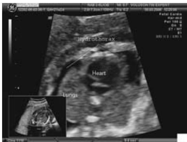
Lungs = pluća; Heart = srce; Hydrothorax = hidrotoraks Figure 5. Ultrasound of fetus with hydrothorax at 22 weeks of gestation Slika 5. Ultrazvuk ploda s hidrotoraksom nakon 22. tjedna trudnoće