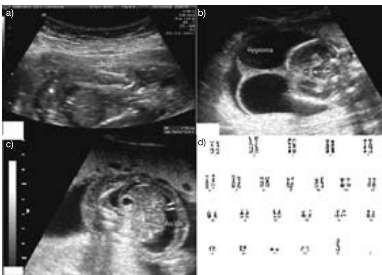
Figure 9. Sonographic markers of Turner syndrome in a fetus at 17 weeks of gestation

The ultrasonically suspected diagnosis of monosomy X is confirmed by determination of karyotype of fetal cells obtained by amniocentesis or chorionic villi sampling of the product of conception in high risk pregnancies. The risk for miscarriage is 0,5% after chorionic villi sampling and amniocentesis in general, while it is 5% for early amniocentesis. To increase the detection rate and to decrease the loss of normal products of conception with optimal cost/benefit ratio, 5% of pregnancies with the highest genetic risk found by prenatal screening should be investigated invasively.