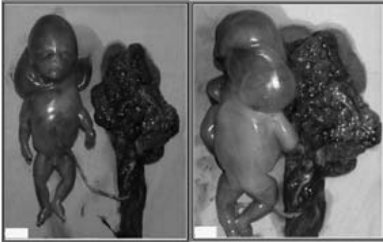
Figure 8. Image of aborted fetus with Turner syndrome at 18 weeks of gestation

Slika 8. Prikaz pobačenog ploda s Turnerovim sindromom nakon 18 tjedana trudnoće