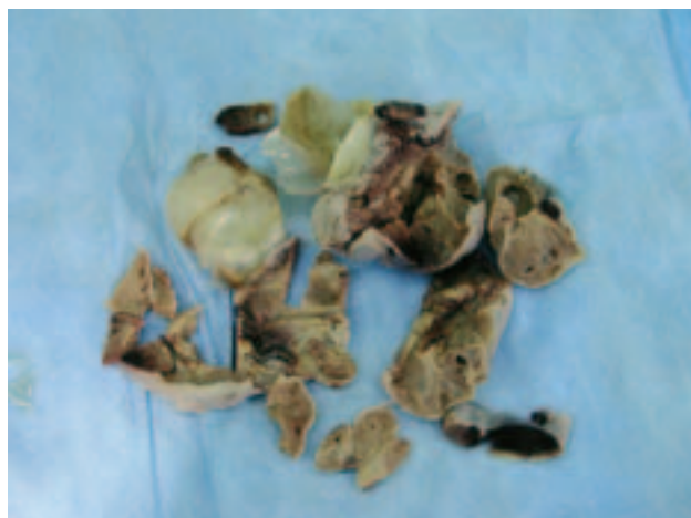
Figure 1. Macroscopic appearance of dissected right ovary of the patient: yellowish solid and cystic particles may be seen

Slika 1. Makroskopski izgled rascijepljenog desnog jajnika bolesnice: vide se žučkasti solidni i cistični dijelovi